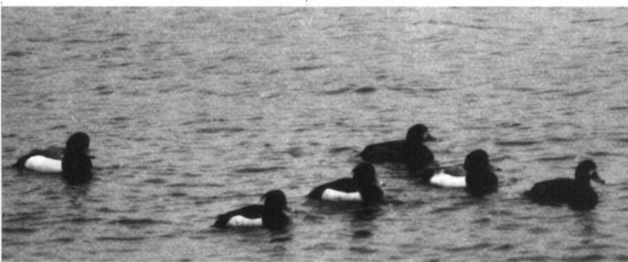
Two male Tufted Ducks (the two black-backed birds together at center) at the Shrewsbury River, New Jersey, in March 1995. Reports of this species in the northeast rarely involve more than single individuals, but this was an unusually good season for the species.

Green-winged Teal of the Eurasian subspecies were more prevalent than usual, with one at Bombay Hook (MG, BP), four in s. New Jersey, and two on Long Island, all in March. Eurasian Wigeons were also noted in good numbers, with a total of about 15 coming from every part of the Region. Highlights were one at L. Ontelaunee Mar. 23 (JHo, KC) and \leq 3 at Montezuma in May. Up to two Tufted Ducks remained in