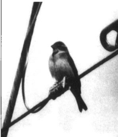
In Bridport, Vermont, this male Dickcissel was singing on territory from May 20, 1995, into June.

The unusually dry weather approached drought conditions in some areas, and contributed to a major forest fire in the New Jersey Pine Barrens. More than 20,000 acres burned in the state's largest fire in more than 30 years. Reservoirs and lakes were low as