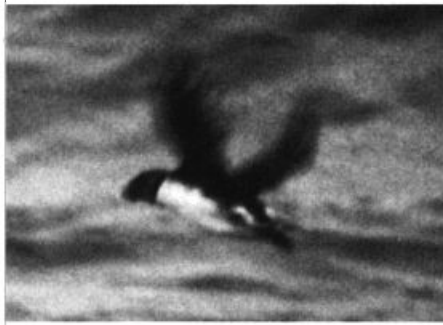
Atlantic Puffin near Block Canyon, off Montauk, New York, March 4, 1995. No fewer than 58 puffins were seen on this day's pelagic trip, an all-time high for New York.

Unprecedented numbers of alcids were encountered on the Mar. 4 pelagic trip out of Montauk. More than 300 Dovekies was an impressive total, but the 13 Com. Murres was easily the highest one-day count ever for New York waters. Two Thick-billed Murres and 71 Razorbills added spice to the trip, but an incredible 58 Atlantic Puffins, also a record, was the most striking tally. Delaware birders had similar good birding from fishing boats out of Cape May; peak totals included 24 Dovekies May 11 (CC et al. ), one