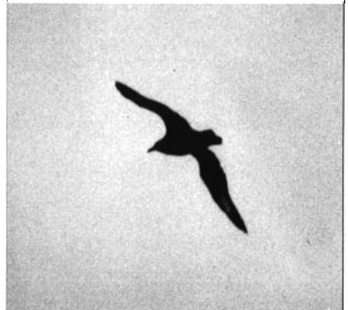
On the pelagic trip from Montauk, New York, to Block Canyon March 4, 1995, this Great Skua was among the highlights.