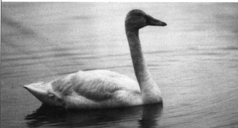
At Reelfoot Lake, Lake County, Tennessee, this immature Tundra Swan remained throughout the 1994–1995 winter season.