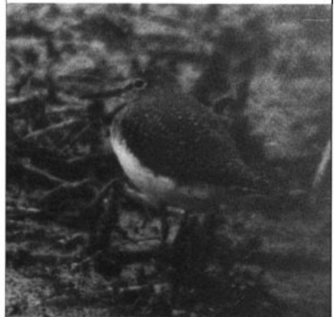
Solitary Sandpiper in Pike County, Mississippi, January 15, 1995. The species is extremely rare in winter in most parts of North America.

An imm. light-morph Swainson's Hawk was sighted in Vermilion , LA Dec. 23 & 31 (DLD, ph. SWC, PW†), and another immature visited Cameron , LA Dec. 24 (SWC, DLD, DA, GA). Golden Eagles in Oktibbeha , MS Dec. 17–18 (MC, TLS, MaS) and Jan. 26 (TLS) were considered rare, as were immatures in Pope , AR Jan. 15 (MM, MB, m.ob.), in Hardeman , TN Dec. 28 (VBR†), and on the Bossier-Caddo-Bienville, LA CBC Jan. 2 (PD†). Present for the 4th consecutive winter in Yalobusha , MS, a Prairie Falcon stayed the season (GK†, SK, m.ob.); another was unusual in Yell , AR Jan. 20 (MP, HP).