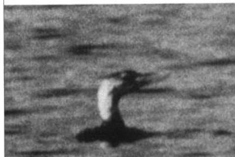
Adding to the growing tally of far inland records, this Yellow-billed Loon was a first for Tennessee at Dale Hollow Lake, Clay County, in February 1995.

Abbreviations: A.B.R.C. ( Alabama Bird Records Committee ); L.B.R.C. ( Louisiana Bird Records Committee ); p.a. ( pending action ); T.B.R.C. ( Tennessee Bird Records Committee ).