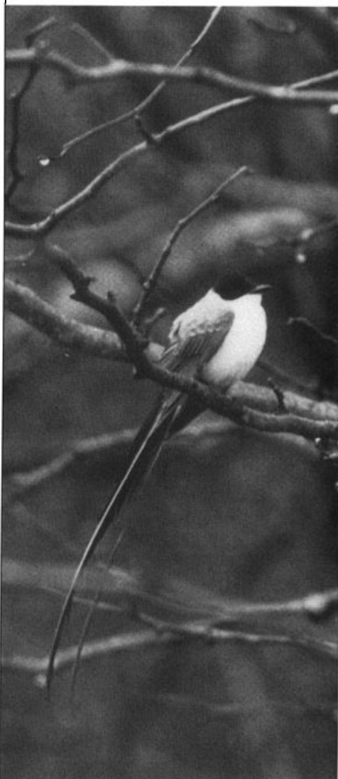
An amazing winter treat was this Fork-tailed Flycatcher near the Holla Bend National Wildlife Refuge, Yell, Arkansas, January 17, 1995.