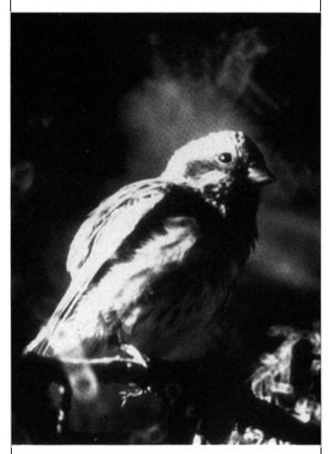
Purple Finch at Conchas Lake State Park, New Mexico, Oct. 22, 1994. The species is a scarce visitor in the state.