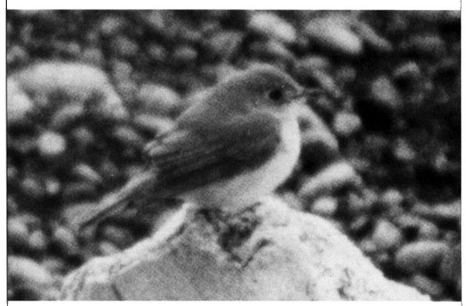
Small and plain, but exciting nonetheless, was this Asian Brown Flycatcher at Gambell, Alaska, June 9, 1994. It provided a second North American record.

catcher was a single reported from Hyder June 8-11 (RFL, WM). Hyder also generated the season's only Western Kingbird sighting, with a single on the tide flats June 9-10 (RFL, WM). Northern Roughwinged Swallow reports included a single s. of Wrangell July 9-23 (PJW), providing a 3rd local record, and ≤four at Hyder June 7-11 (RFL, WM). Hyder and Wrangell are the only sites where this form has bred in Alaska. Prospecting Barn Swallows were located at nests well beyond known breeding sites. A pair built a nest on a frame tent near Gold Hill in the Nutzotin Mts. on the n. slope of the Wrangell Mts., June 18-19 (†TJD, WR), and ≤four pairs attended nests on a shed at Portage, mid-June+ (JLD, et al.). This e. North Gulf Coast breeder has nested casually, and usually unsuccessfully, in the Anchorage area. Details of a Common House Martin came in from St. Paul I. from July 10 (†DB), furnishing a 2nd report from the Pribilofs. The field description did not unequivocally rule out the recently split allospecies Asian House Martin, a problem noted on several recent sight records.