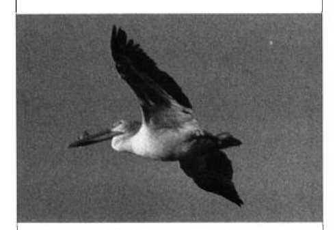
American White Pelican at Hillman Marsh, Ontario, June 2, 1994. Fifth record for the Point Pelee area.

Mute Swans continued their slow northward spread with Algonquin's 2nd record July 2 (m.ob.) and one well n. at New Liskeard June 4 (LT). A Brant at Cranberry Marsh, Durham June 11 (RT) showed nigricans characteristics. "Western" ducks breeding in s. Ontario included a \Re N. Pintail with young at Hamilton June 26 (KM); N. Shoveler families at Hamilton June 11 (AE), Mud L., Niagara July 12 (BF, KR), and