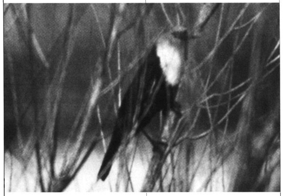
Male Yellow-headed Blackbird at McClintic Wildlife Station, West Virginia, April 9, 1994.