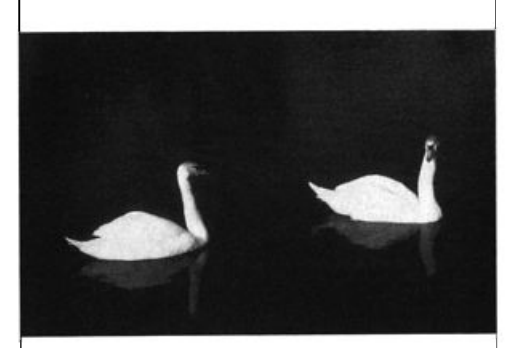
Two Mute Swans near Belpre, Washington County, Ohio, April 1, 1994.

A Greater White-fronted Goose at Pine L., OH March 19 (NB) was noteworthy. The only Snow Goose reports were of six Mar. 21 in Allegheny , PA ( fide PH) and one at P.I.S.P., May 3 (SSt), a late date. The 6000 Canada geese at Pymatuning L. in early March had dropped to 500 by mid-April (RFL).