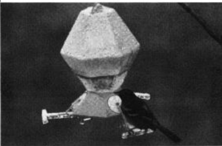
Male Orchard Oriole patronizing a hummingbird feeder at Pabos Mills, Gaspé Peninsula, Quebec, at the end of May 1994.