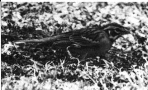
Lark Sparrow at Saint-Léon, Quebec, in mid-May 1994. Eighteenth record for the province.