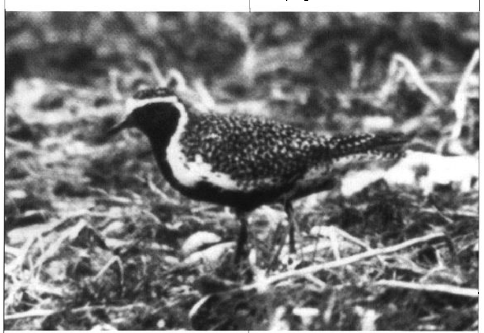
One of the largest recorded Invasions of Greater Golden-Plovers brought at least 200 to Newfoundland this spring. This one was at St. John's May 2, 1994.

Although this was the only redpoll found at that latitude, some other birds on the Gulf Coast were probably driven there by the conditions of the winter. Saddest of the lot was a lone King Eider, lethargic and in worn plumage, probably doomed, that lingered on the Louisiana coast for much of April and May. The