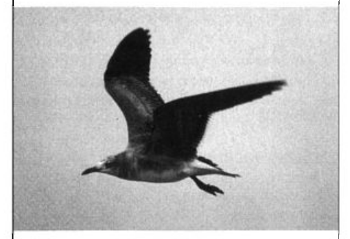
Surprisingly far inland, and at an odd season, was this first-winter Laughing Gull at Bakersfield, California, December 30, 1993.