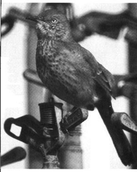
A rare visitor to the California coast, this Bendire's Thrasher was at Point Mugu, Ventura County, February 13, 1994.