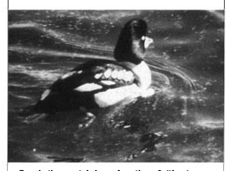
Rare in the coastal slope of southern California was this male Barrow's Goldeneye on Lake Cachuma, Santa Barbara County, January 17, 1994.