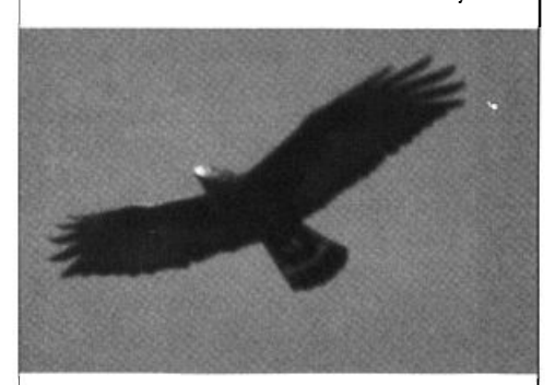
A scattering of Zone-tailed Hawk reports over southern California was unusual, especially for the winter season. This adult was over Ojal, Ventura County, at the end of February 1994.