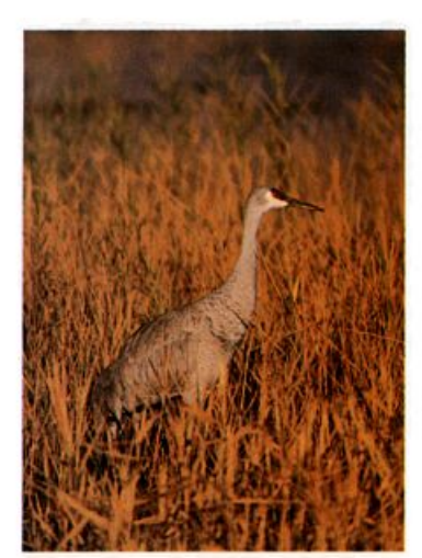
Birders and others interested in wildlife come to the Festival of the Cranes at the Bosque del Apache National Wildlife Refuge in New Mexico. Above, a Sandhill Crane.

Many advocates of ecotourism believe education will address these con-