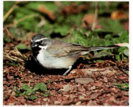
A surprising movement brought Black-throated Sparrows to four sites around the western Great Lakes region. This one was found at Sibley Provincial Park, Ontario, on October 3, 1992, to provide a first record for the province.