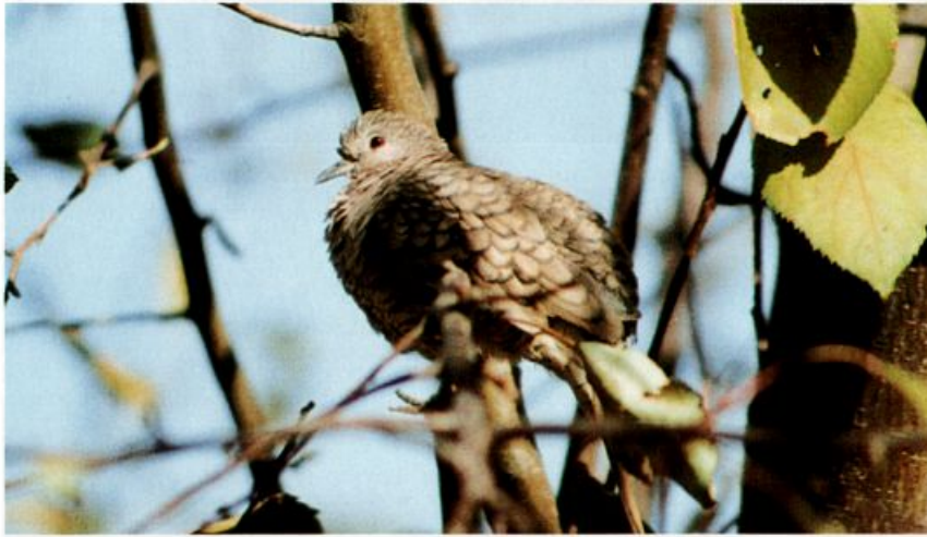
Inca Doves, wandering northward, created excitement in several areas. This one furnished a first Colorado record at Lafayette on November 15, 1992 (but it was followed by five more individuals at two other sites before the end of the month).