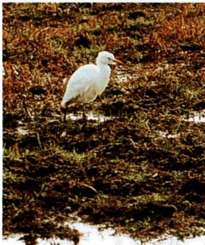
Unprecedented numbers of Cattle Egrets invaded British Columbia during the season. This one was north to Eaglet Lake on October 31, 1992.