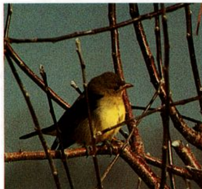
Scarlet Tanager at Bell Crossing, Ravalli County, Montana, on November 17, 1992. Seventh state record. Occurrences of this rare stray in the west can be surprisingly late in the fall.