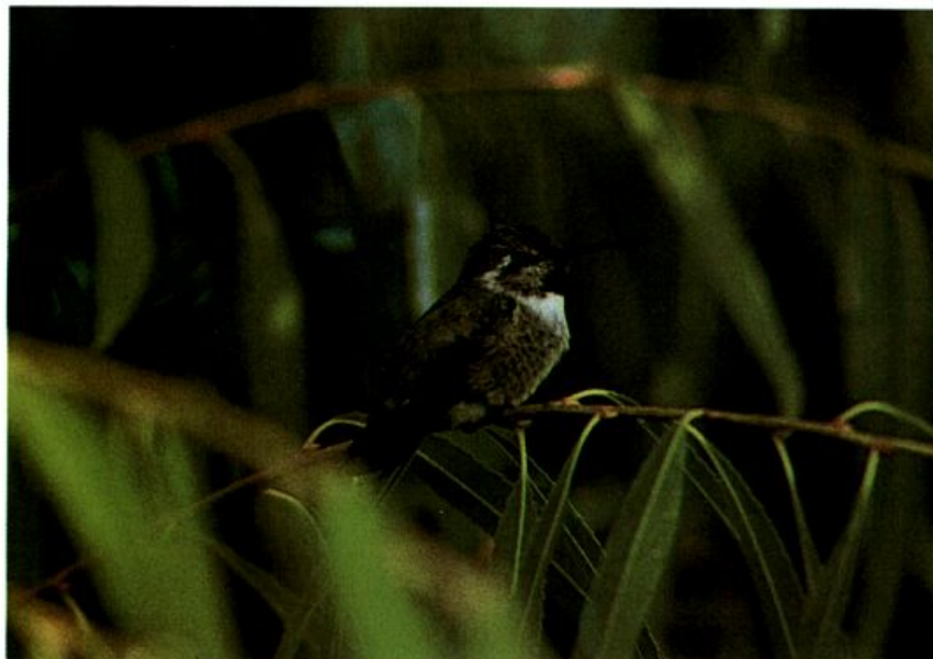
Immature male Costa's Hummingbird at El Paso, Texas, September 16, 1992. This bird furnished only the fourth documented state record.