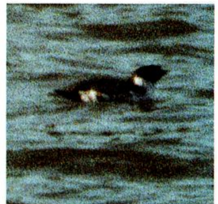
A distant view of a fabulous find, this Ancient Murrelet was on Lake Ontelaunee, Pennsylvania, on November 8, 1992. It provided a first state record and one of the easternmost ever for North America.