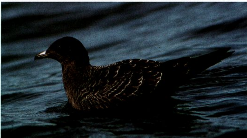
This juvenile Long-tailed Jaeger was at Lake Millwood, Arkansas, October 12-21, 1992. Admirably well documented, it provided the second record for the state. Photograph/Charles Mills.