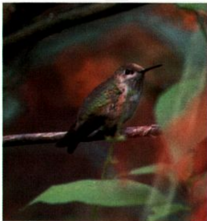
Mississippi's first Calliope Hummingbird appeared in Hancock County November 21-25, 1992. This stray from the west has now been recorded in four of the six states in the Central Southern Region.