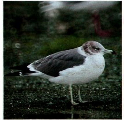
Black-tailed Gull at Ketchikan, Alaska, on October 8, 1992. The state had three previous records of this Asiatic gull, but Ketchikan lies in extreme south-eastern Alaska, a vast distance away from the sites of the prior occurrences.