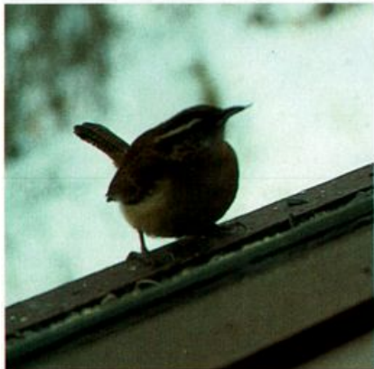
Carolina Wren (with a slight bill deformity) at Winnipeg, Manitoba, November 9, 1992. Although the province had seven previous records, this was the first one in over a decade.