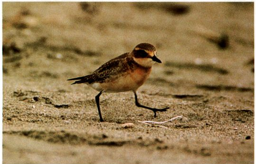
It was dubbed "the season of the plovers" in northern California. One of the reasons (aside from four dotterels) was this juvenile Mongolian Plover, present September 16-20 at Moss Landing for a fifth state record.