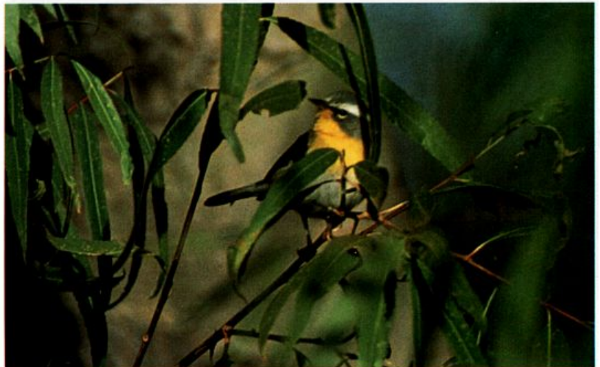
This Crescent-chested Warbler proved elusive most of the time, but it remained for months at Patagonia, Arizona, providing a third record for the United States. This shot was taken November 25, 1992.