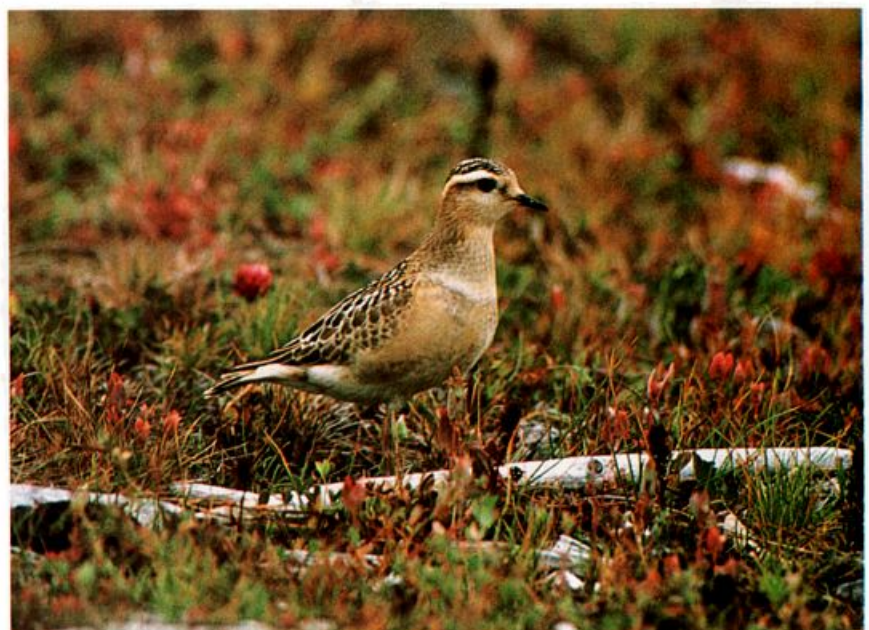
Juvenile Eurasian Dotterel at Lake Talawa, Del Norte County, California, on September 11, 1992. California had only three previous records, but there were four in the state this fall.