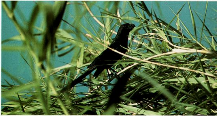
At least four Groove-billed Anis reached California this season, to double the total number of state records. This one was near Blythe on October 10, 1992.