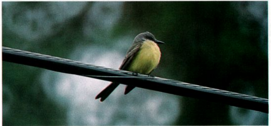
Not your typical Alaskan bird: this Tropical Kingbird at Ketchikan on October 9, 1992, provided a second state record.