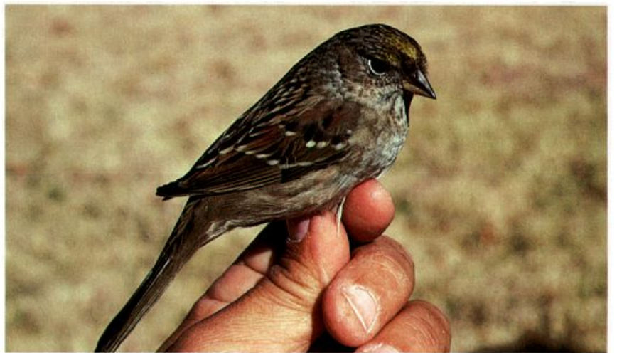
Golden-crowned Sparrow at Davis Mountains State Park, Texas, on November 11, 1992. Texas had only ten previous documented records. Although this plumage is often illustrated as "immature," many adult Golden-crowns are similarly dull in winter.