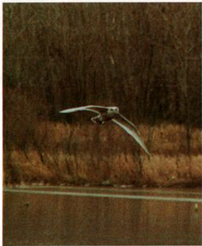
Glaucous-winged Gull, thought to be in second-winter plumage, at O'Brien Lock and Dam, Chicago, Illinois, on December 4, 1992. First discovered in late November, this bird furnished a first state record.