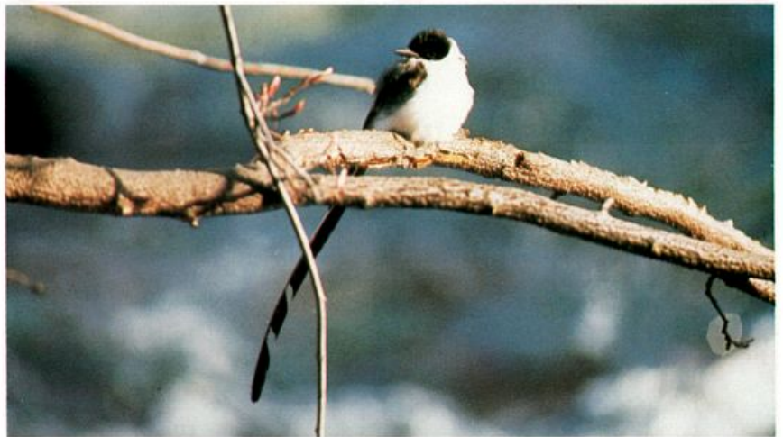
The recent string of remarkable rarities at Grand Marais, Minnesota, continued with this Fork-tailed Flycatcher—only the second for the state—present for about the first half of May, 1992. Photograph/Anthony Hertzell.