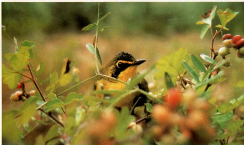
Remarkable numbers of Kentucky Warblers (and some other "southeastern" warblers) were found in southern California this spring. This male Kentucky Warbler was one of three found along the upper Santa Ynez River on May 28, 1992.