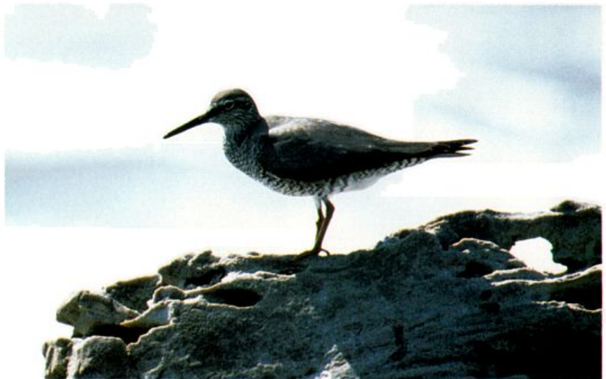
On the Galveston Seawall, this Wandering Tattler lingered for two weeks, giving many the chance to observe this first Texas occurrence.