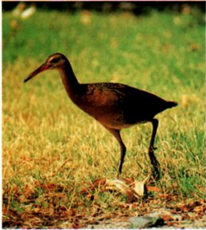
Some western forms of Clapper Rail are rather brightly colored, and they also inhabit some freshwater marshes, unlike the drab saltwater Clappers of the east. However, this bird in Desert Center, California, on May 31, 1992, was far from suitable habitat.