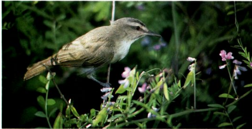
With increasing coverage of coastal Alabama hotspots, the Black-whiskered Vireo is proving to be regular there in small numbers in spring. This one was at Fort Morgan, Alabama, on April 11, 1992.