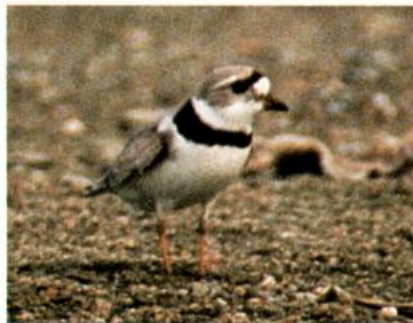
This Piping Plover at Presque Isle State Park, Pennsylvania, during May 1992, appeared to be on territory; the species had not nested in this area since the 1950s.