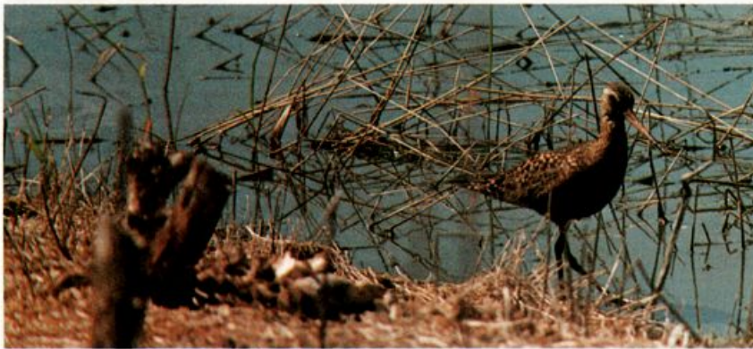
Central British Columbia had an unusual influx of Great Plains migrant shorebirds in May, including Hudsonian Godwits and Lesser Golden-Plovers. This Hudsonian Godwit furnished a first record for the Prince George area on May 12, 1992.