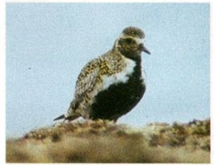
Greater Golden-Plover (one of three present) at Portugal Cove South, Newfoundland, on April 27, 1992. This spring represented only the fifth time that Newfoundland had recorded multiples of this species. Photograph/Bruce Mactavish.