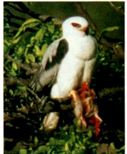
Black-shouldered Kite continues to be reported more widely across North America. This one at Beaver Dam Wash on April 18, 1992, provided a third record for Utah.