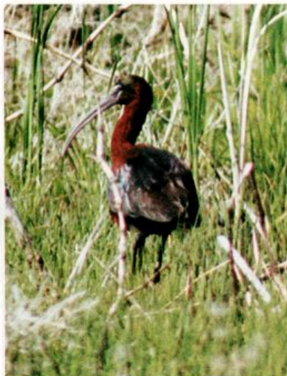
Apparently dark-eyed, and with its face apparently outlined with pale skin, not pale feathers, this ibis was identified as an adult Glossy Ibis. Appearing in Jefferson County, Kansas, on May 3, 1992, it furnished a first state record.