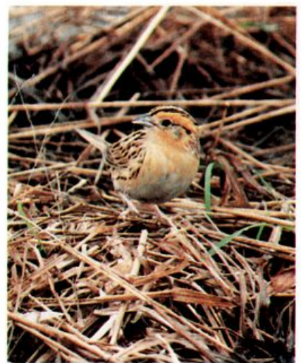
An unprecedented six Le Conte's Sparrows were found in the Hudson-Delaware region this spring. This one, the first for eastern Pennsylvania, was at Struble Lake on April 26, 1992.