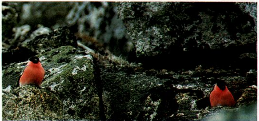
Eurasian Bullfinch is among the most elusive of spring vagrants to Alaska, but no fewer than six were present at Gambell, St. Lawrence Island, on May 29, 1992; two males are shown here.