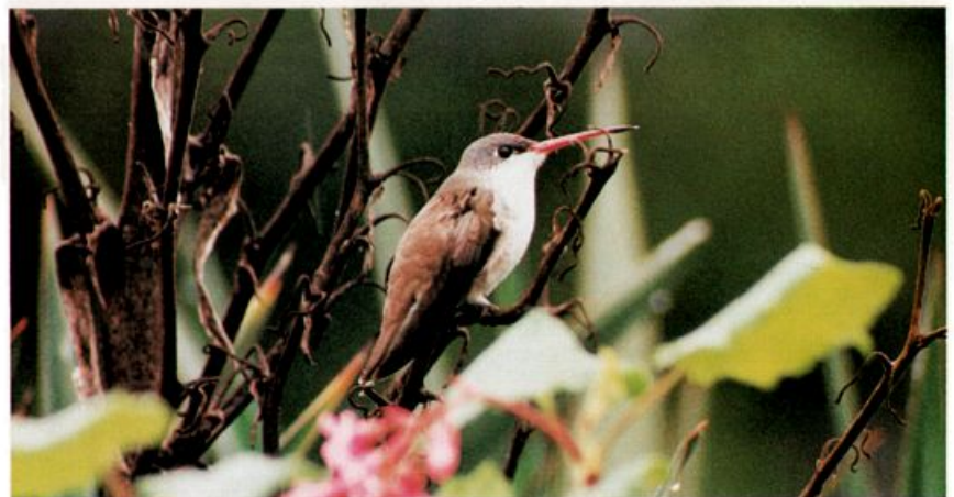
A pioneering vagrant was this Violet-crowned Hummingbird at Kenwood, California, on March 3, 1992. It provided a first record for northern California, and perhaps the northernmost record ever for this Mexican species.