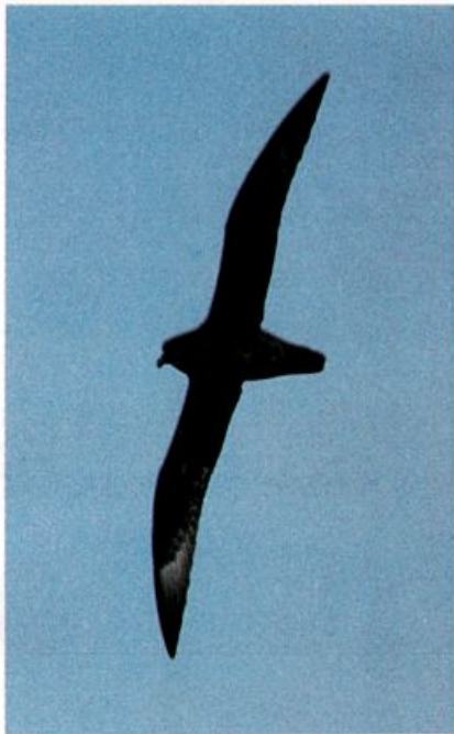
Washington observers made a calculated search for their state's first Murphy's Petrel, and found 24 of them, far offshore from Westport on April 25, 1992.