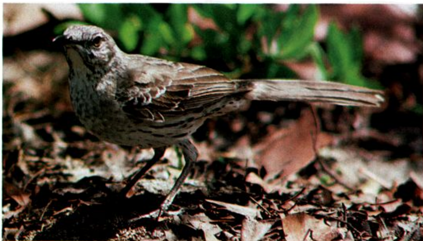
Less than twenty years after the first United States sighting, Bahama Mockingbirds racked up an amazing four records in Florida this spring. This one was on the Dry Tortugas on April 25, 1992. The mottled chest of this bird led some observers to wonder if it were an immature, but the amount of wear on the wings suggests an adult.