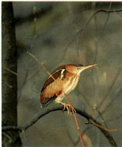
At the tip of Point Pelee, Ontario, this female Least Bittern was out of normal habitat as well as being exceptionally early for Ontario on April 12, 1992. Photograph/T. Shimba.