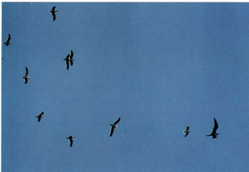
On March 14, 1992, a Great Frigatebird soared over California's fabled Southeast Farallon Island—providing a sensation for the local Western Gulls, and providing a second record for North America.