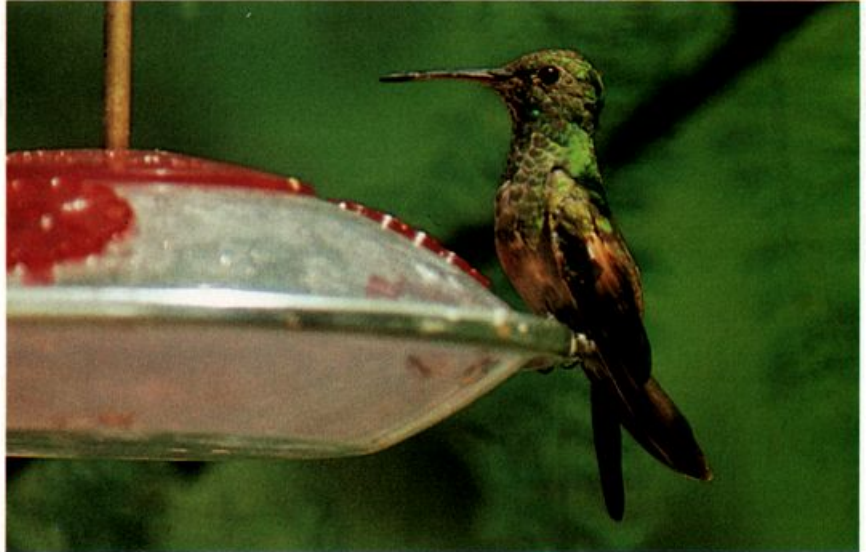
Berylline Hummingbird has become almost an annual visitor from Mexico to Arizona, but few records are as early as May. This individual, photographed May 11, 1992, was present most of the month at Portal in the Chiricahua Mountains.