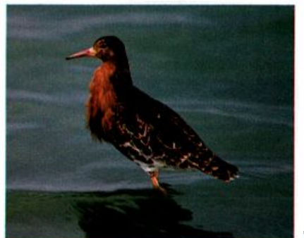
A visual stunner was this male Ruff in full breeding finery that stopped at Steinbach, Manitoba, on May 10, 1992.