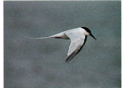
Roseate Terns are generally rare along the southern Atlantic Coast, but recently they have been found regularly at Cape Hatteras Point, North Carolina. Taken there on May 20, 1992, was this classic portrait, showing the very long tail and long bill, and dark gray restricted to the outer three primaries.