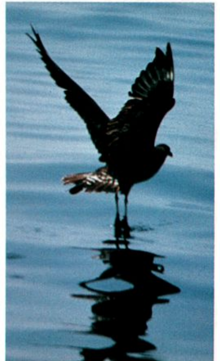
About 35 miles east of Indian River Inlet, this subadult Pomarine Jaeger was photographed May 25, 1992, for one of the few fully documented records for Delaware.