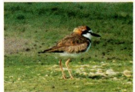
A classic "stealth vagrant" was this Col-lared Plover, a first for the United States, at the Uvalde National Fish Hatchery, Texas, on May 9, 1992.