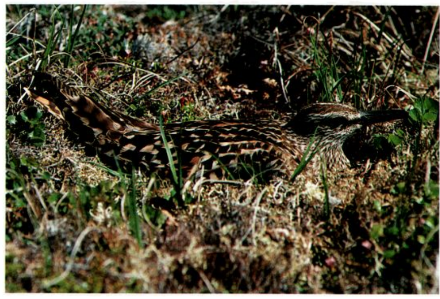
Many curlews eschew the shelter of dwarf shrubs, nesting instead in exposed sites on the open tundra.

that aggressively defend their own nests from potential predators. Such defense is so effective that Longtailed Jaegers experience the highest nest success (92%; n=13 nests) of any species in our study areas, particularly in the Nulato Hills. Not unexpectedly, large shorebirds nesting close to Long-tailed Jaegers tend to have higher nest success than do those nesting in more isolated sites. The