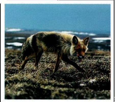
The Red Fox is only one of many predators which threaten Bristle-thighed Curlews on the breeding grounds.

tle-thighed Curlew these costs are incurred on the breeding grounds. From the time they arrive there in early May until they depart again for the wintering grounds in August and September, curlews are exposed to a host of predators. Gyrfalcons (Falco rusticolus), Golden Eagles (Aquila chrysaetos), Rough-legged Hawks (Buteo lagopus), Northern Harriers (Circus cyaneus), Parasitic Jaegers