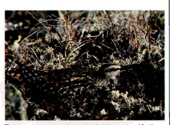
The tan and cinnamon edges on the dark brown dorsal feathers mently attacked as bona correspond closely to the variegated patterns of tundra fide threats to the curlew vegetation.

brood. If his efforts alone do not adequately discourage the intruder, the female leaves the brood to join the attack as well. Indeed, this behavior is so strong that we were able to elicit mob-attacks to capture most individ-