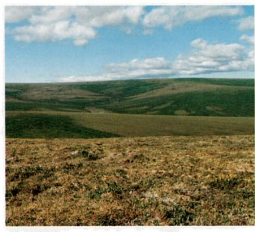
cealment afforded from avian predators. For example, in the Peninsula.

Similarly, curlews, as well as other large shorebirds, frequently nest near other species, such as Long-tailed Jaegers ( Stercorarius longicaudus ),