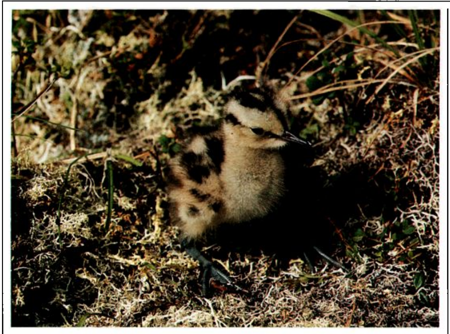
Soon after drying, downy curlew chicks are ready to leave the nest.

form communal groups of young. We cannot yet discount other possible explanations, however. For example, curlews may form aggregations simply to congregate around limited food resources.