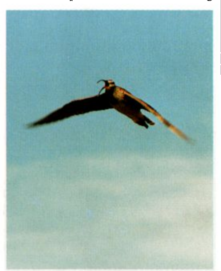
When defending their young, attack-mobbing curlews may actually strike threatening predators.

For the first several days after hatching, the curlew family usually remains within a few hundred meters of the nest site. Over the next two weeks, as the chicks grow and become increasingly mobile, parents begin to lead their young on long treks. Broods may move more than two kilometers in a single day and cross running streams, dense alder thickets, and vast fields of knee-high hummocks. Eventually, numerous broods of just volant young, and occasionally some older, still-flightless young, coalesce into aggregations near the tops of mountains. Among