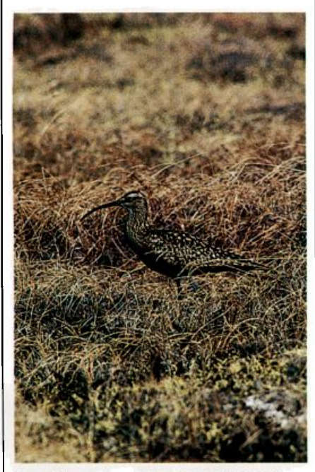
Soon after arrival in May, adult curlews blend cryptically into the muted hues of the snow-free tundra.

Bristle-thighed Curlews exhibit an impressive ability to discriminate among potential predators. Species that normally pose little threat to adult curlews, such as harriers and owls, may be virtually ignored early in the season. Golden Eagles and Gyrfalcons, on the other hand, are treated with greater respect. When their dark silhouettes soar above the undulating terrain, adult curlews often freeze, then slowly crouch in si-