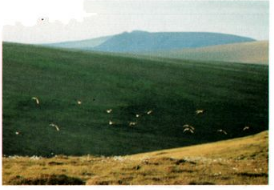
runs are accompanied by a Flocks of failed breeders and off-duty nesters may include as many as 90 curiews.

confront and physically attack species that could capture and kill them, such as Golden Eagles and Rough-legged Hawks. More often than not, the male curlew is the first to initiate familial defense, attacking predators up to 400 meters from the uals we wished to color-mark.