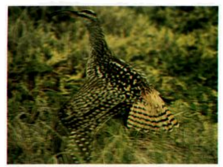
During distraction displays in the immediate vicinity of the nest, the diagnostic rusty tail is displayed conspicuously.

brood. If his efforts alone do not adequately discourage the intruder, the female leaves the brood to join the attack as well. Indeed, this behavior is so strong that we were able to elicit mob-attacks to capture most individ-