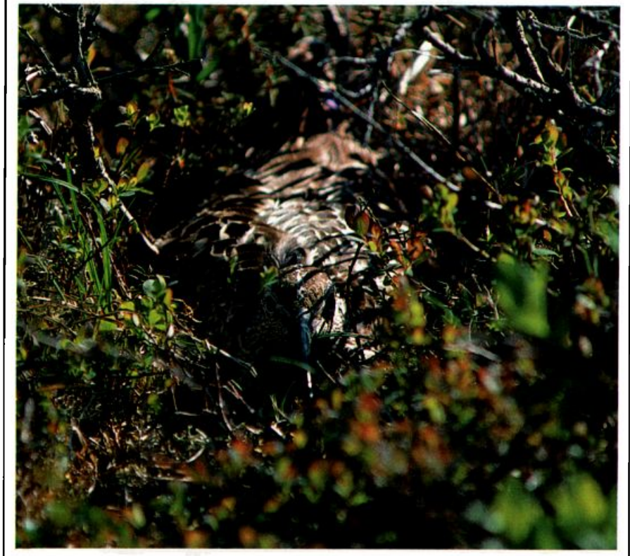
The shadows of dwarf willow branches enhance the camouflage of nesting Bristle-thighed Curlews.

If the predator is not dissuaded and fooled but actually discovers the nest, the curlew's response escalates. Ravens, Parasitic Jaegers, and even