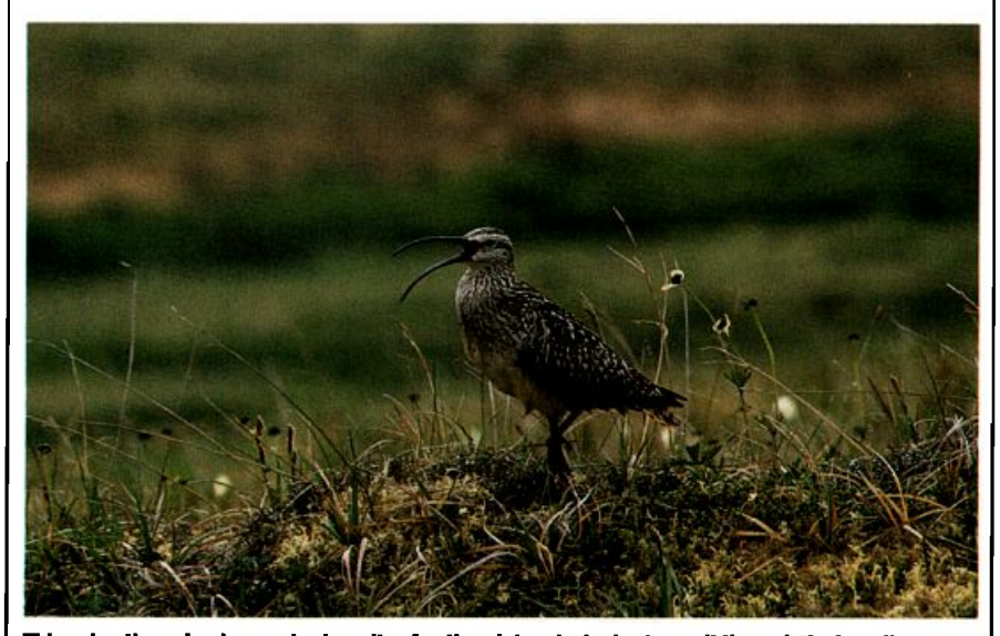
This enimatic curlew has evolved a suite of antipredator strategies to see it through the breeding season and back to its tropical Pacific wintering grounds.