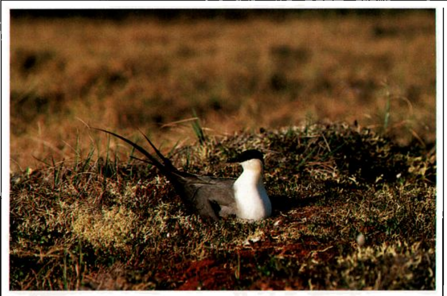
Through their aggressive attacks on predators, Long-tailed Jaegers provide a protective umbrella for curlews and other species nesting within their defended area.

humans near a curlew nest are frequently subjected to attack-mobbing. Whether diving or approaching at eye level, the parent curlew flies directly at the potential predator, sometimes closing to within one meter before breaking away. A particularly aggressive curlew may actually strike its antagonist. These strafing harsh, shrill "krreee" call. Such behavior becomes even more pronounced just before the eggs hatch, especially toward humans.