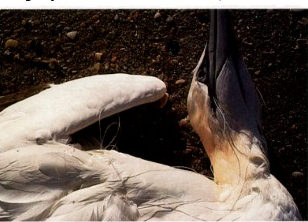
Adult Northern Gannet

Audubon researchers have found that White-crowned Pigeons play a major ecological role in maintaining the health and diversity of Florida's tropical hammocks (see Am. Birds , Vol. 45 No. 2, p. 195). The majority of hammock tree species produce a fleshy fruit that