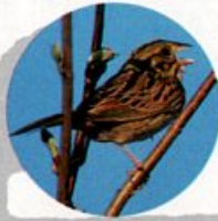
Henslow's Sparrow, 7000 Hz.