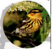
Cape May Warbler, 10,000 Hz.