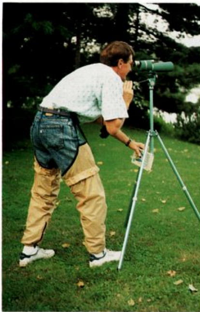
A feature of tick Chaps is the "tick flap," an inverted cuff located at mid-thigh designed to impede the upward movement of ticks.

Right now, Tick Chaps are a cottage industry available through the