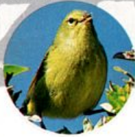
Orange-crowned Warbler, 6500 Hz.