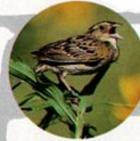
Grasshopper Sparrow, 8600 Hz.