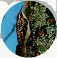
Brown Creeper, 7000 Hz.