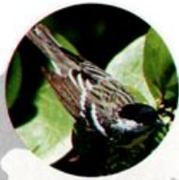
Blackpoll Warbler, 8900 Hz.