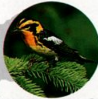
Blackburnian Warbler, 7300 Hz.