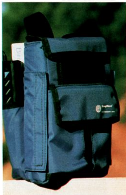
A nylon field case holds the SongWand, compact disc player, speaker, discs and field guide. Total weight: about three pounds.

SongWand will be available in about six months through Kimball's