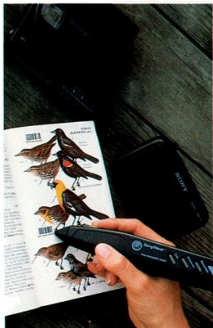
As the SongWand is moved across the bar code, the pictured bird's song is called up on a portable compact disc player.

stuff to put together, consider this, it is all lightweight and compact enough to be taken into the field. Kimball has designed a small nylon carrying case with velcro closures and compartments that is worn over the shoulder. It carries the wand, compact disc player, speaker, discs and field guide. Total weight is about three pounds while the size is eight inches high by six inches wide by two inches deep.