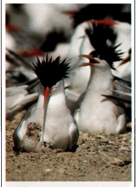
Adult Elegant Tern in breeding plumage with young. Bolsa Chica Ecological Reserve.