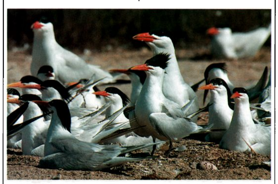
Nesting aggregation of Elegant and Caspian terns. Bolsa Chica Ecological Reserve 1990.

In both cases the changes in the population status of these two terns seems directly related to changes in their fish food stocks. The Northern