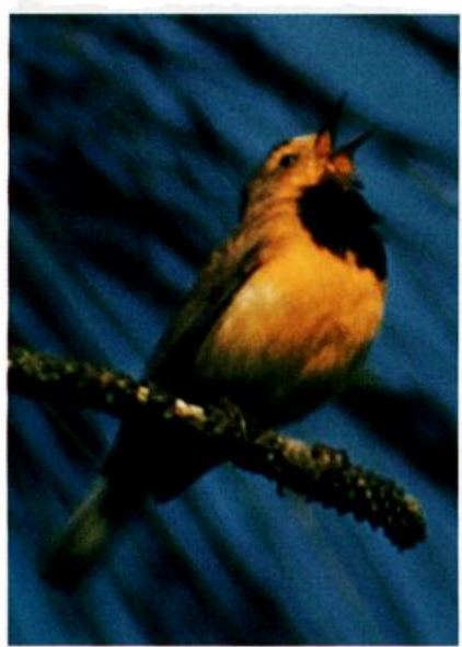
There is still faint hope that the Bachman's Warbler exists in Cuba.

There is a tad more hope for the tiny Bachman's Warbler, a former denizen of our Southern canebrakes. The last reasonably good photographs of one were taken in southern Florida in 1977, and the last sightings by numbers of birders were in the early 1960s. Citing habitat destruction on its breeding grounds and modern hurricanes on Cuba, its sole wintering ground, many ornithologists have therefore written off the species.