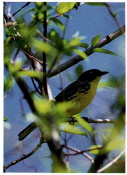
If ever there were a species marked for extinction, it is the Kirtland's Warbler.

There has been, however, a recent change in the bird's status. Though not enough is known about the present population, a scarcity of reports is taken as a warning sign.