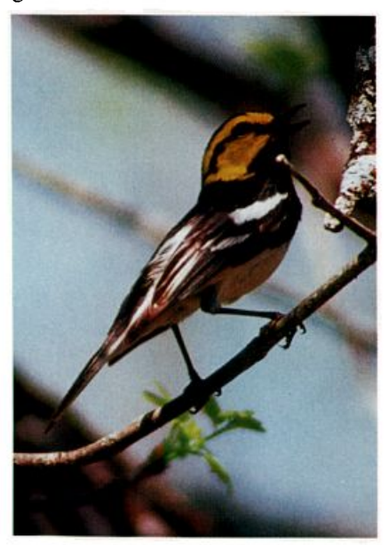
The Golden-cheeked Warbler was granted emergency "endangered" listing in 1990.

Like the Spotted Owl, this small bird is chained to old growth: needing older trees because it builds its nests of peeling bark, it breeds only in forests of Ashe Juniper (locally called cedar brakes) on and around the Edwards Plateau in central Texas. In winter it retreats to the forests of Central America, spreading out over an area larger than its breeding grounds but, as National Audubon's