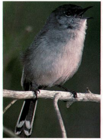
The California Gnatcatcher is the Spotted Owl of the Southern California coastal strip.