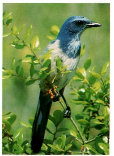
As the Florida Scrub Jay's numbers dwindle, it may be raised to the status of a full species.

Fitzpatrick estimates that there are about 10,000 individual Scrub Jays scattered over the peninsula. "The jay is very specialized and confined to early postfire successional scrub on what were ancient sand dunes," he says. "The habitat