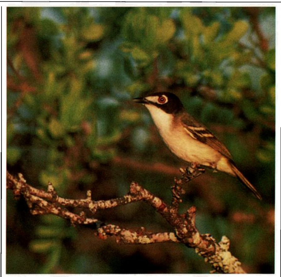
Plagued by a variety of predators and increasing urbanization, the Black-capped Vireo is gone from Kansas and may disappear altogether.

Furthermore, the Black-capped is plagued over all its remaining range by a complex of efficient predators. Fire ants and Scrub Jays attack the nests, and birds living in populated areas are a target for house cats.