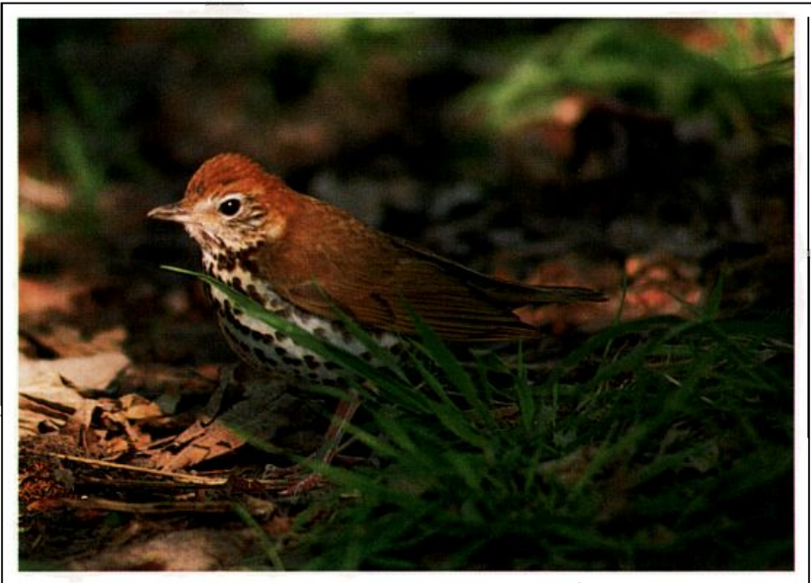
The Wood Thrush is suffering a long-term collapse.

Generalizations based partly on speculation?