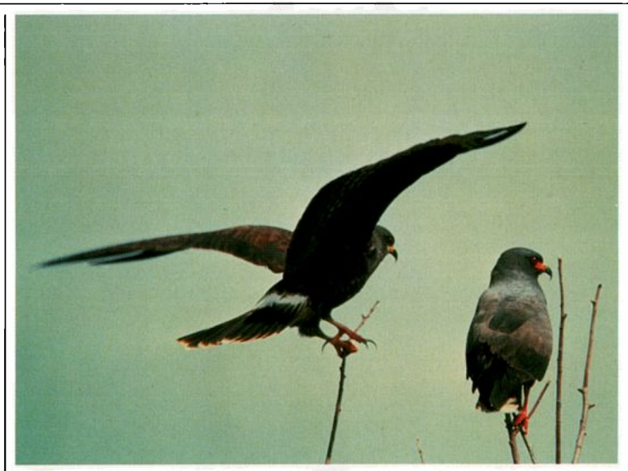
The fate of the "endangered" Snail Kite depends on how weather and water affect apple snails on which the bird feeds almost exclusively.

But the survival of an array of other Florida birds, seems to depend, like the upland Scrub Jay's, on what happens during the next decade.