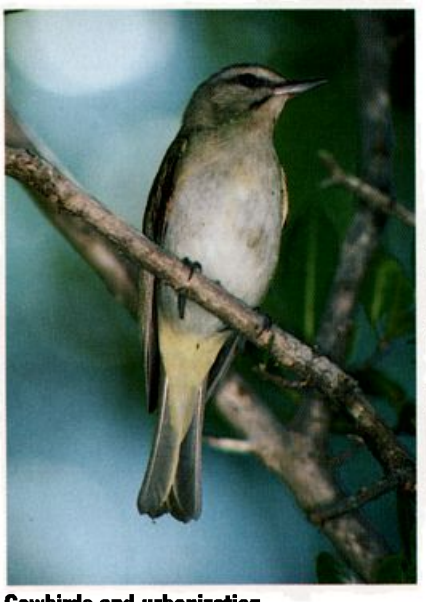
Cowbirds and urbanization threaten to wipe out the Black-whiskered Vireo in Florida.

Moving from the country's south-Continued on page 1194