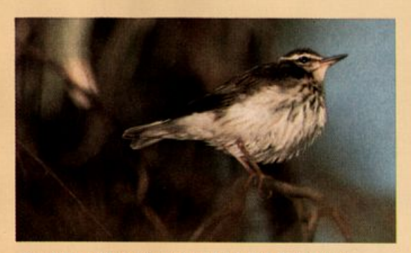
Louisiana Waterthrush at La Jolla, California, February 1990. Only the third state record. Even at this odd angle, the large bill and flaring supercilium are apparent; the bird has just a trace of cinnamon-buff on the flanks.