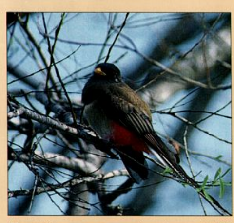
Elegant Trogons are occasionally reported in Texas, but this female at Delta Lake on January 28, 1990, was one of very few ever to be documented in the state.