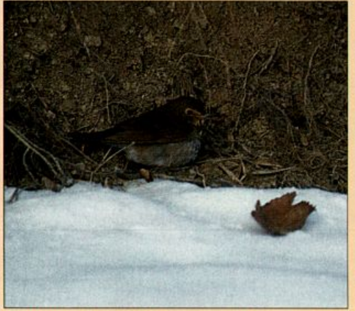
For those of us who have always been skeptical of winter reports of Swainson's Thrush in North America, this bird's occurrence was a jolt: this Swainson's Thrush was in Essex County, Ontario, December 17, 1989.