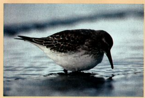
At least three very late White-rumped Sandpipers stayed to December 16, 1989, at St. John's, Newfoundland. This individual, photographed December 3, still had many of its pale-edged juvenal coverts and scapulars, and so was easily identified as a first-winter bird.