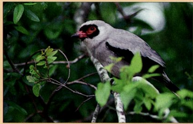
Male Masked Tityra at Bentsen State Park, Texas, February 20, 1990. Although there had been one previous sighting, this represented the first confirmed record for the United States.