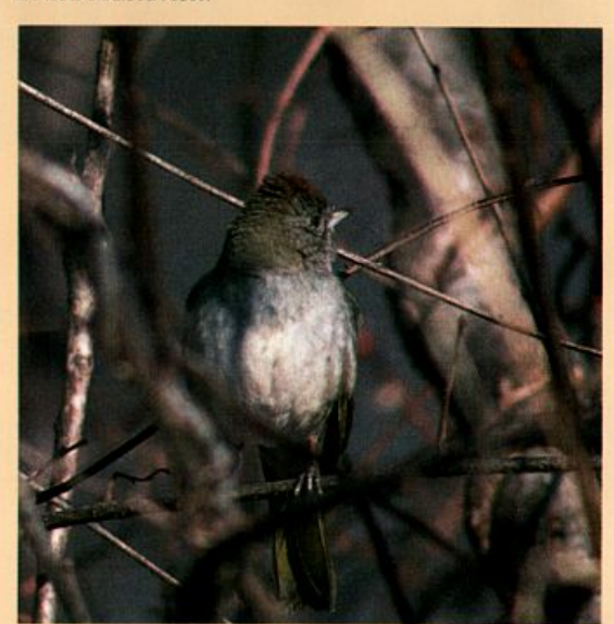
Green-tailed Towhee at Brattleboro, Vermont, February 24, 1990. First state record.