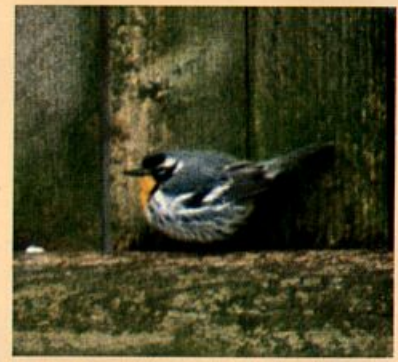
Yellow-throated Warbler at Marblehead, Massachusetts, present from November to December 14, 1989.