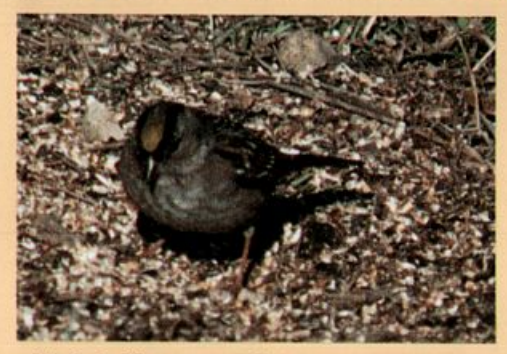
Adult Golden-crowned Sparrow at Green River Conservation Area, Illinois, February 19, 1990. This bird was apparently spending its second winter at this location.