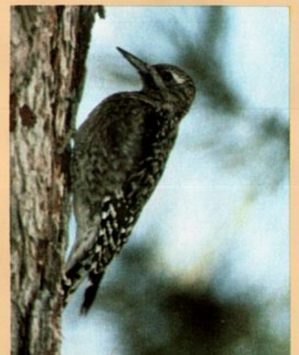
Yellow-bellied Sapsucker in first-winter plumage at Fort Collins, Colorado, January 5, 1990. By this time in the winter, Red-naped or Red-breasted sapsuckers would have molted into essentially adultlike plumage.