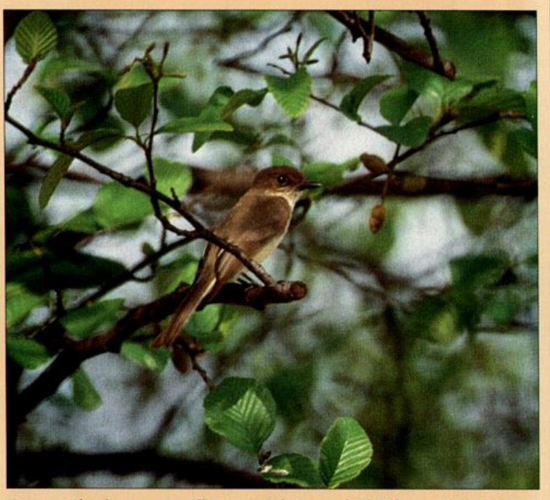
Eastern Phoebe present all winter (photographed February 25, 1990) at Irvine, California.