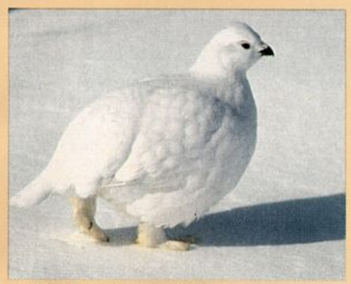
Willow Ptarmigan 280 kilometers north of Matagami, Quebec, February 16, 1990.