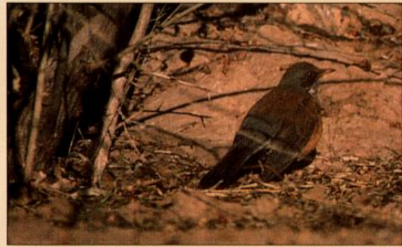
Rufous-backed Robin south of San Antonio, New Mexico, December 21, 1989. One or two individuals were present here in mid-December, providing the state's second documented record.