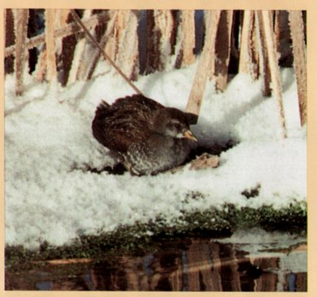
This Sora in Will County, Illinois, December 22, 1989, clearly picked the wrong year in which to linger so late in the season.