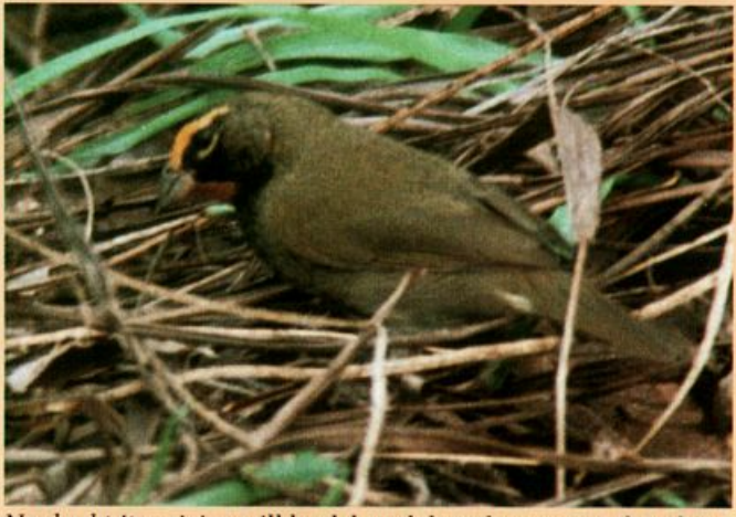
No doubt its origins will be debated, but chances are that this male Yellow-faced Grassquit was a genuine stray from Mexico, considering the other birds that wandered north this season. It was photographed January 24, 1990, at Santa Ana National Wildlife Refuge, Texas.