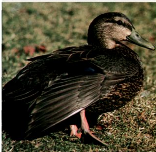
"Although he defended the Red-legged Black Duck to the end, William Brewster was never bitter about the opposition it encountered, only wounded at the sarcasm." Photograph/ R.Villani/VIREO (v05/2/017).

—506 East 82nd Street New York, NY 10028