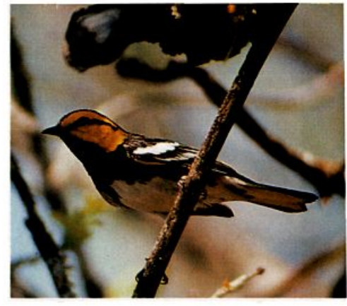
Golden-cheeked Warbler off of Comanche Trail, Travis County, Texas.

ing territories in Texas early in March While little is known about the migration patterns of this uncommon species, both of these observations, as well as the records cited by Pulich (1976), suggest that the bulk of migrating spring birds funnel through a narrow corridor of mountain ridges above 1000 meters along the eastern slope of Mexico (Figure 1). The Golden-cheeked Warbler seems increasingly threatened on two fronts First, the escalating real estate pressures for developing the Edwards Plateau and second, the potentially catastrophic destruction of winter habitat in Central American tropical forests In addition, future efforts to manage this species may also need to focus on preserving its transitory bottleneck through the cloud-forest ridges of the Sierra Madre Oriental.