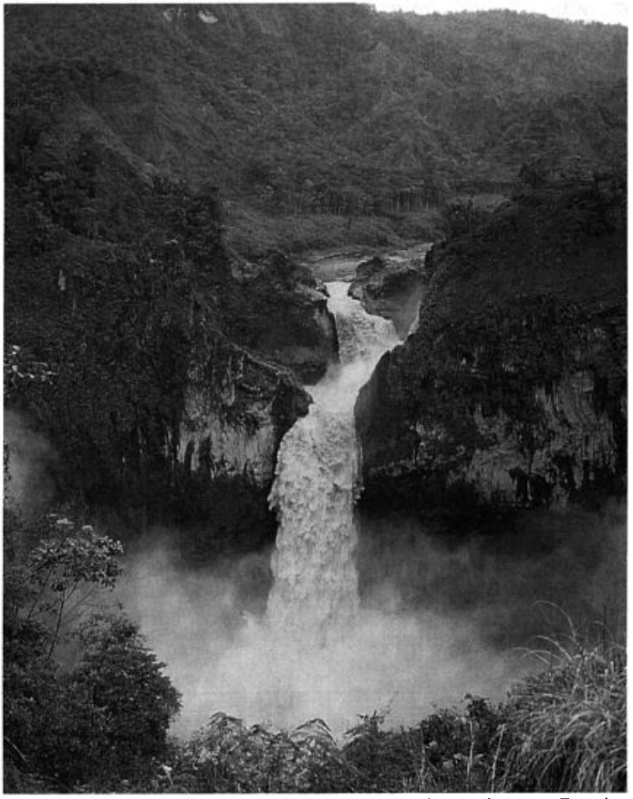
Coca Falls, Northeastern Ecuador