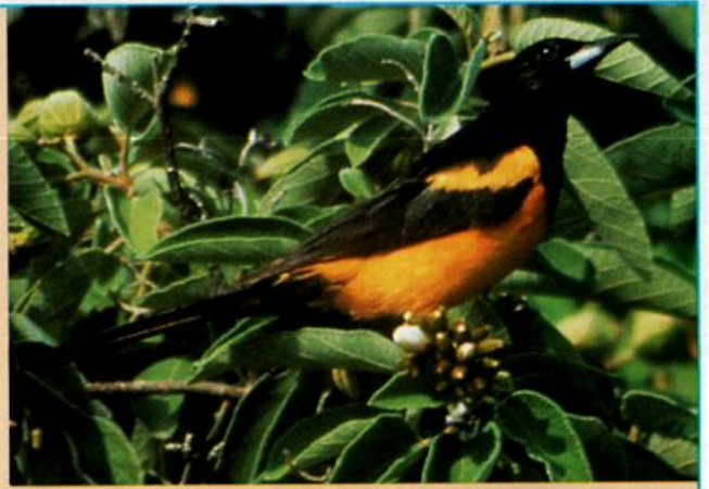
Black-vented Oriole south of Kingsville, Texas, July 29, 1989. Second documented record for the United States.