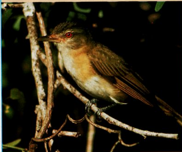
Yellow-green Vireo at Laguna Atascosa National Wildlife Refuge, Texas, July 9, 1989. A pair of these vireos nested at the refuge this season.