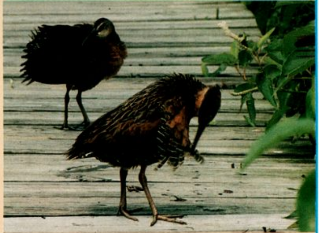
Pair of King Rails (male in foreground) preening on the boardwalk at Huntley Meadows County Park in Fairfax County, Virginia, July 15, 1989.