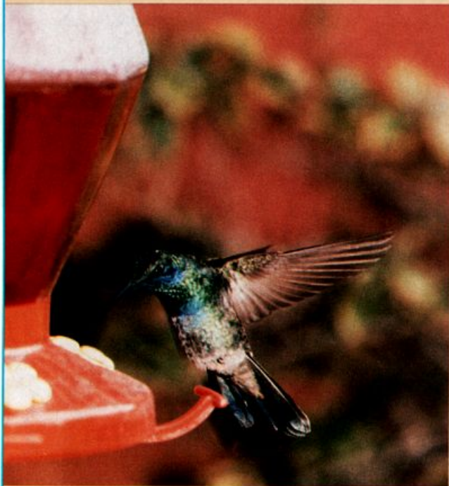
Green Violet-ear at Sinton, Texas, July 6, 1989.