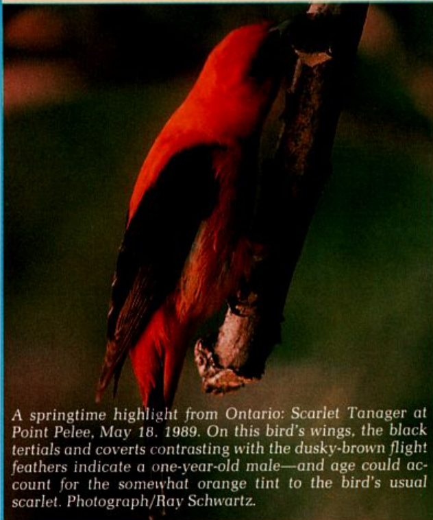
A springtime highlight from Ontario: Scarlet Tanager at Point Pelee, May 18, 1989. On this bird's wings, the black tertials and coverts contrasting with the dusky-brown flight feathers indicate a one-year-old male—and age could account for the somewhat orange tint to the bird's usual scarlet.