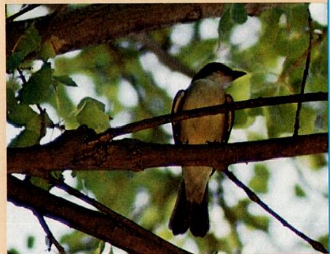
Juvenile Thick-billed Kingbird at Cottonwood Campground, Big Bend National Park, Texas, July 29, 1989. This bird fledged from the first known Texas nest.