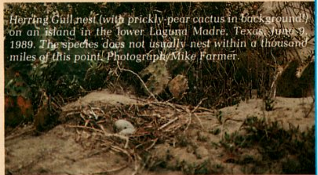
Herring Gull nest (with prickly-pear cactus in background) on an island in the lower Laguna Madre, Texas, June 9, 1989. The species does not usually nest within a thousand miles of this point.