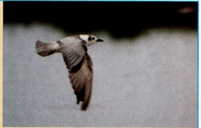
White-winged Tern in first-summer plumage at Cape May, New Jersey, June 5, 1989. This age class of the species had apparently never been found in North America before.