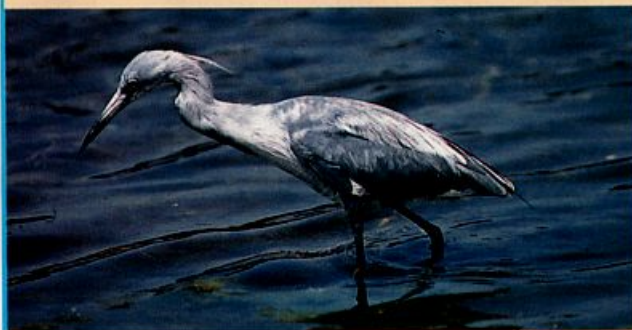
This bird at Marina del Rey, California, was variously considered to be either a Little Blue Heron x Snowy Egret hybrid or a partially albinistic Little Blue Heron. As seen in this photo, the bird had the bill pattern, bill shape, and foraging posture of a Little Blue, suggesting that the latter identification was correct.