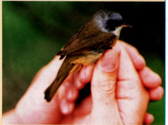
Probable Mourning Warbler x Common Yellowthroat hybrid at Sherbrooke, Quebec, June 2, 1989.