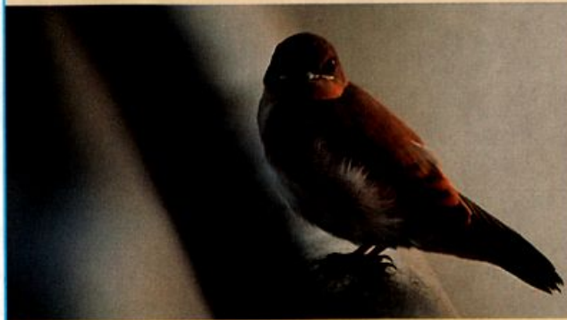
Northern Rough-winged Swallow at Washington, D.C., June 24, 1989. In very fresh juvenal plumage, this bird shows broad rusty edges on the tertials and a wash of buff on the throat.