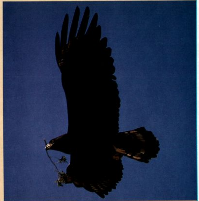
Zone-tailed Hawk carrying nest material at Devil's River State Natural Area, Texas, April 22, 1989. The species is local as a breeder in the Texas hill country.