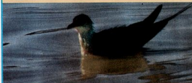
Adult Long-tailed Jaeger at Carson Lake, Nevada, August 11, 1989. This bird, the second Long-tailed for the state, apparently arrived in mid-July.