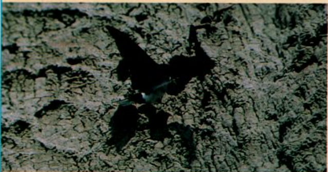
Violet-green Swallow entering a nest at the North Unit of Theodore Roosevelt National Park, North Dakota, July 8, 1989. First confirmation of breeding for the state.