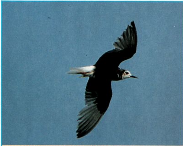
Adult White-winged Tern at Bombay Hook, Delaware, July 22, 1989.