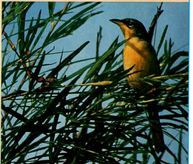
Male Gray-crowned Yellowthroat at the Sabal Palm Grove, Texas, June 6, 1989.