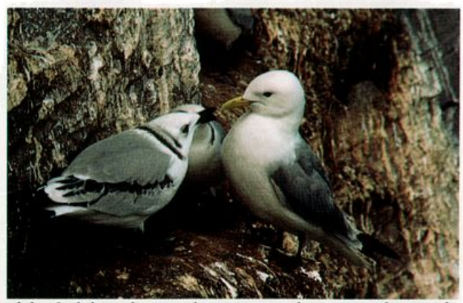
Adult Black-legged Kittiwake at nest, with two juveniles, nearly full-grown. Photograph/Dan Roby and Karen Brink/VIREO (r05/1/072).