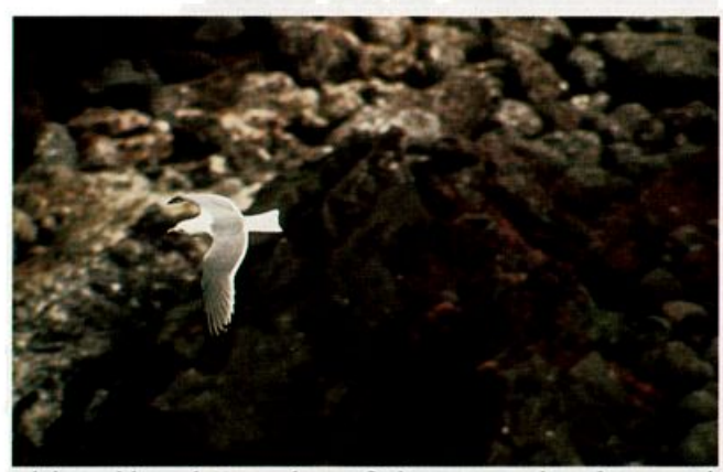
Adult Red-legged Kittiwake in flight. Distant shot, for general impression. Photograph/J.P. Myers/VIREO (m01/22/030).