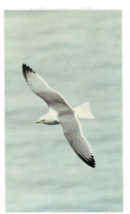
Adult Red-legged Kittiwake. (m01/22/032).

tricky in the far north, and even the Black-legged can look very darkbacked when seen against a backdrop of ice or sunlit water. However, the amount of contrast in the outer part of the wing produces a pattern that is distinctive for each kittiwake.