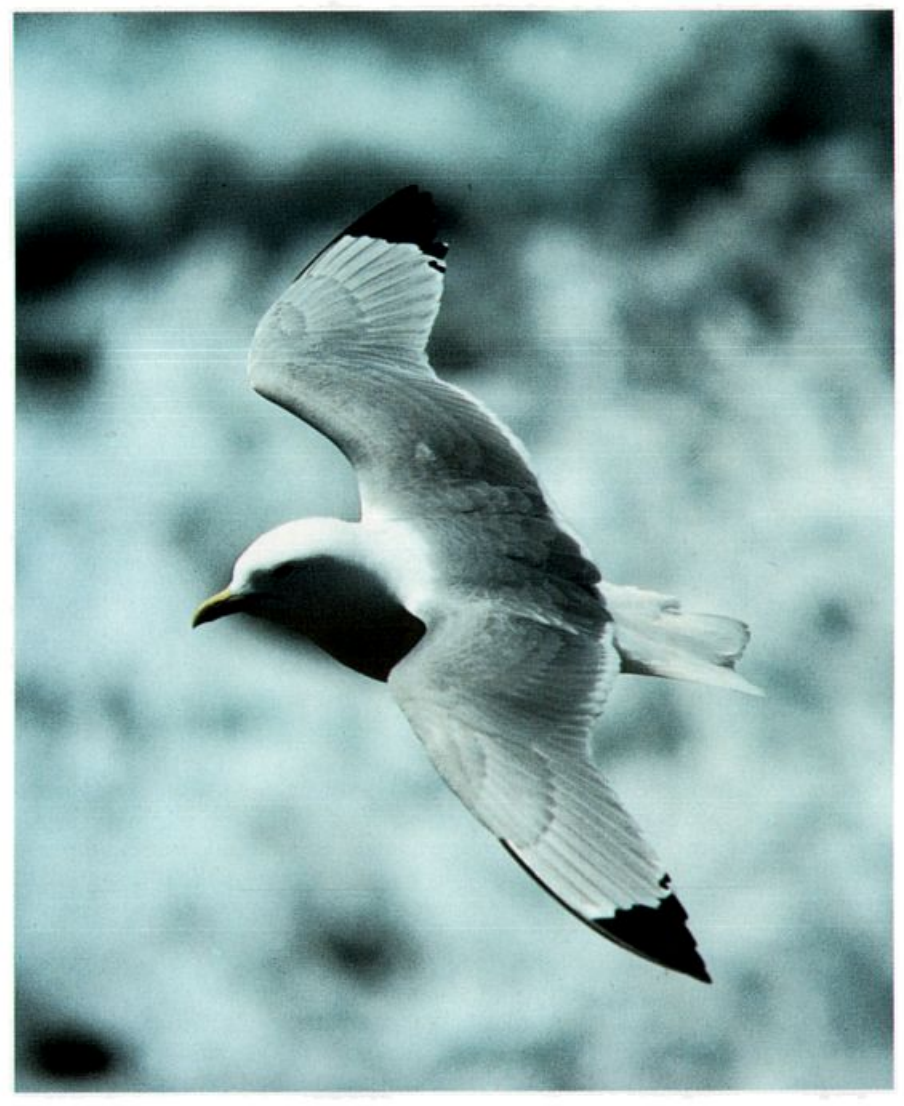
Adult Black-legged Kittiwake in flight. Effects of lighting here cancel out much of the effect of pale primaries. Photograph/Russell Hansen/VIREO (h10/3/006).