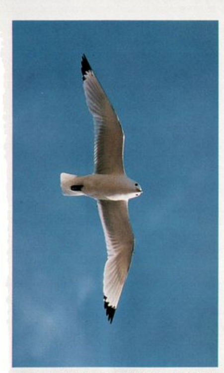
Adult Black-legged Kittiwake overhead.

darker on the back than the Blacklegged, and it has similar black triangles on the wingtips. But it shows no trend toward paler gray on the outer primaries; the same dark gray extends out the wing to meet the black at the tip, with far less contrast than in the Black-legged. As a result, the black wingtip is not so obvious. However, the white trailing edge of the wing is much more noticeable on the Redlegged, especially on the primaries.