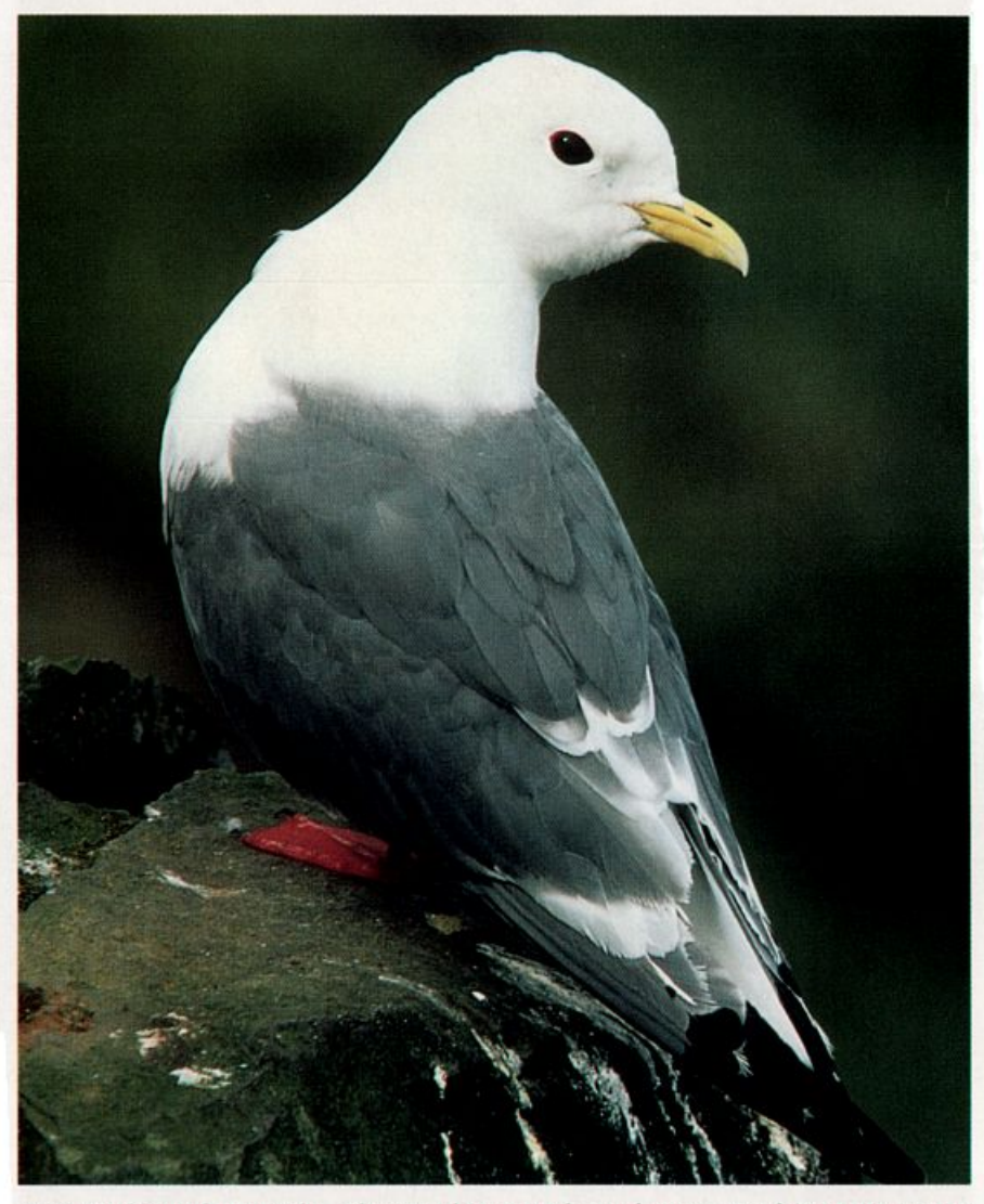
Adult Red-legged Kittiwake.