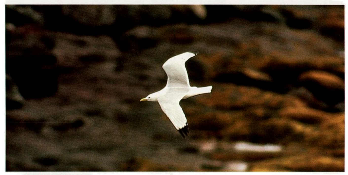
Adult Black-legged Kittiwake in flight. Distant shot, for general impression. (m01/22/029).

expressions at close range, and even flying at a distance the Red-legged may look shorter-headed. Standing, the Red-legged looks more compact, with shorter legs.