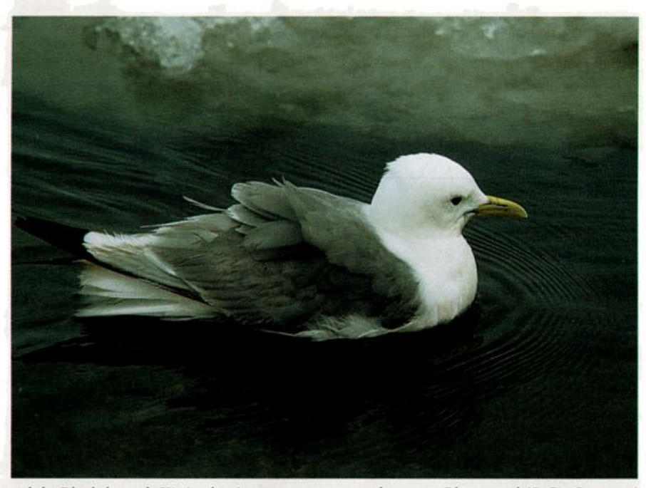
Adult Black-legged Kittiwake in worn summer plumage.

But there is a second type of kittiwake tucked away in the corner of the world east of Siberia and west of Alaska. To be precise on a global scale, we need a modifier for either species. So we North Americans officially refer to the widespread one as the Blacklegged Kittiwake, and to the Bering Sea specialty as the Red-legged Kitti-