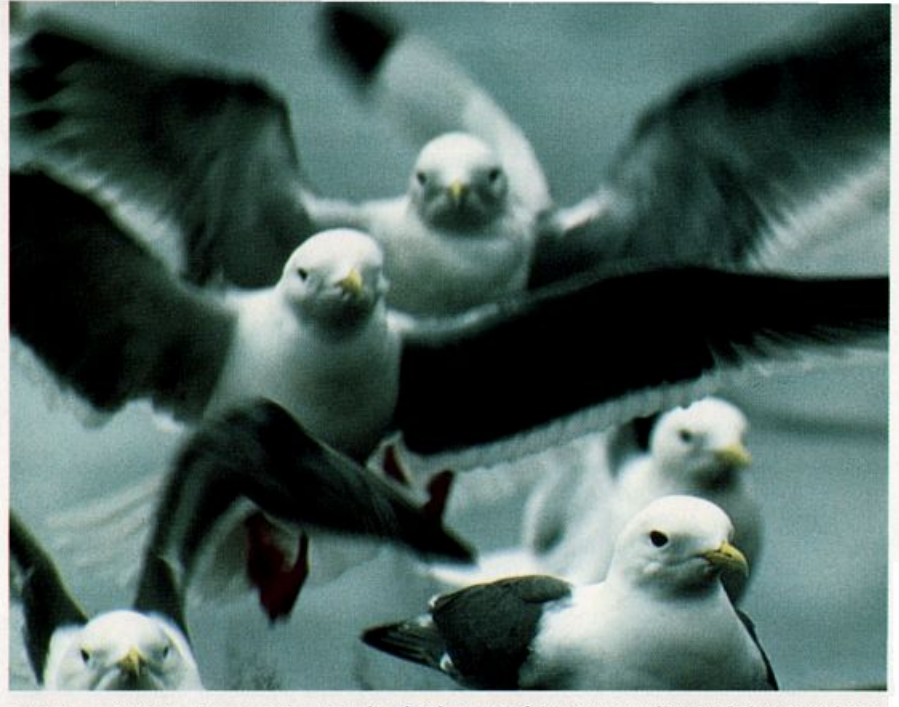
Red-legged Kittiwakes coming in to land. Photograph/J.P. Myers/VIREO (m01/22/028).

As with so many other cases involving similar species, shape is also a good field mark. The specific name of the Red-legged, brevirostris , means "short-billed"; its bill is not only shorter than that of its relative, but also looks more blunt at the tip. Accenting this effect is the steeper forehead of the Red-legged. The distinction in head and bill shapes gives the two kittiwakes very different facial