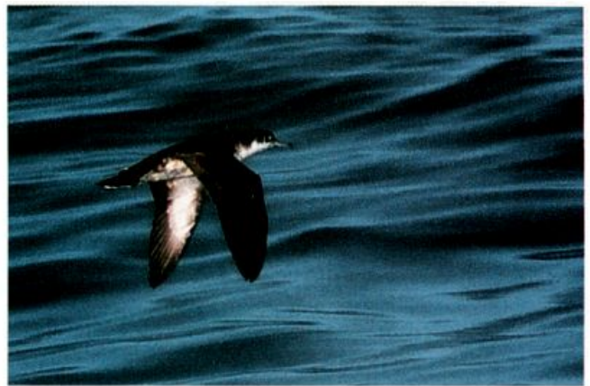
Audubon's Shearwater off Oregon Inlet, N.C., June 1987. Not a rare species, but rarely photographed so well. The face pattern, underwing pattern, and long-tailed effect are all evident here.