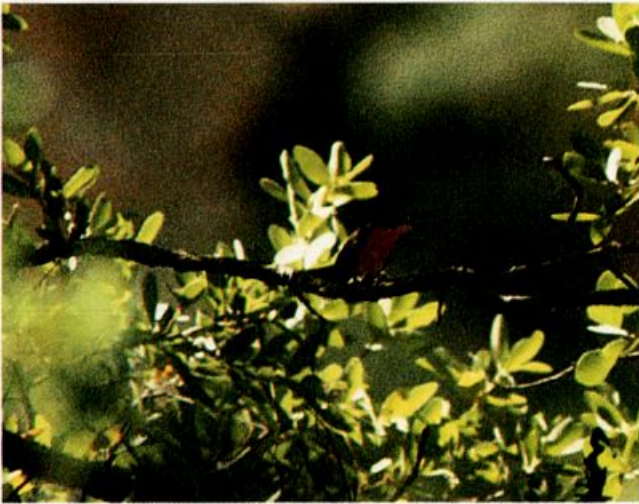
Fan-tailed Warbler in Sycamore Canyon, Ariz., June 7, 1987. About the fourth report for the United States.