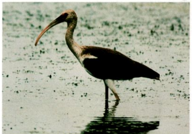
Immature White Ibis in St. Clair County, Ill., July 31, 1987. Photo/Joe B. Milosevich.