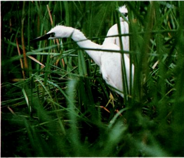
Flightless young Snowy Egrets photographed at Minnewaukan Flats June 28, 1987, for the first documented nesting in North Dakota.