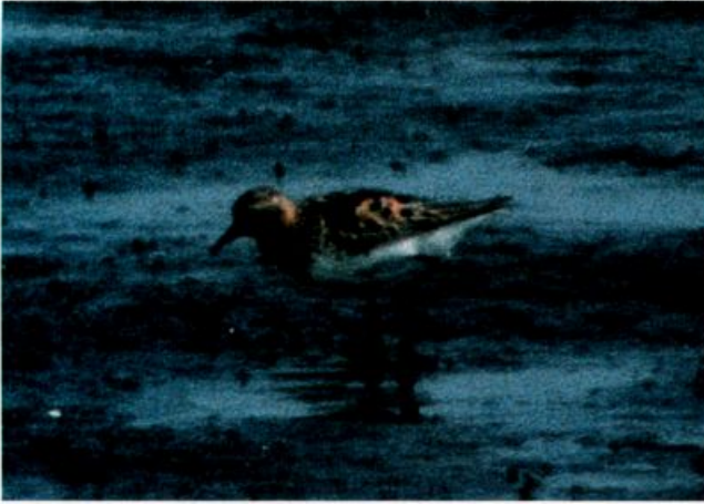
Adult Rufous-necked Stint at Bombay Hook N.W.R., Del., July 25, 1987.