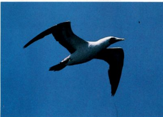
Adult Masked Booby off Oregon Inlet, N.C., July 25, 1987.