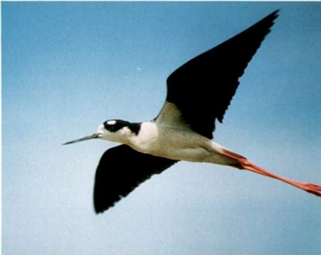
Adult Black-necked Stilt, one of the birds that nested at Deal Island W.M.A., Md., June 28, 1987.