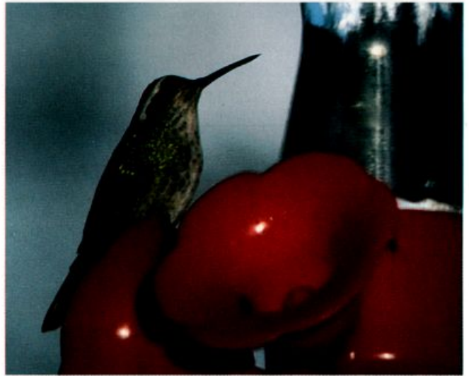
White-eared Hummingbird (female or immature male) on Mt. Lemmon, Santa Catalina Mts., Ariz., August 1987. Compared to Broad-billed Hummingbird, this genuine White-eared shows a shorter bill, bolder white "ear" stripe, and a pattern of green disks on white underparts.