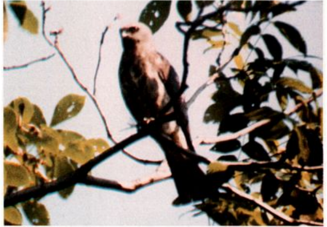
One-year-old Mississippi Kite south of Leesburg, Loudoun Co., Va., June 7, 1987. Apparently the first documented Virginia record (after several sight records).