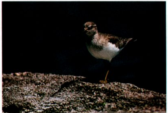
Terek Sandpiper at Sooke, B.C., July 21, 1987. Notice the recurved bill, short legs, and relatively plain plumage pattern. First documented record for Canada, and first North American record south of Alaska.