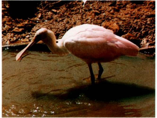
Immature Roseate Spoonbill at Oklahoma City, Okla., July 25, 1987.