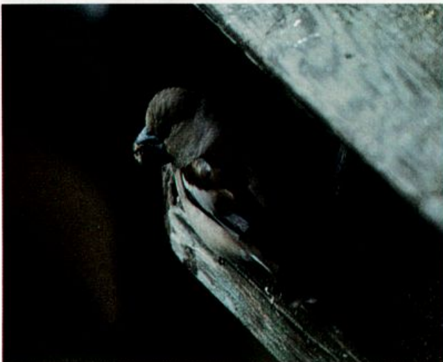
Hawfinch at Adak Island, Alaska, June 21, 1987.