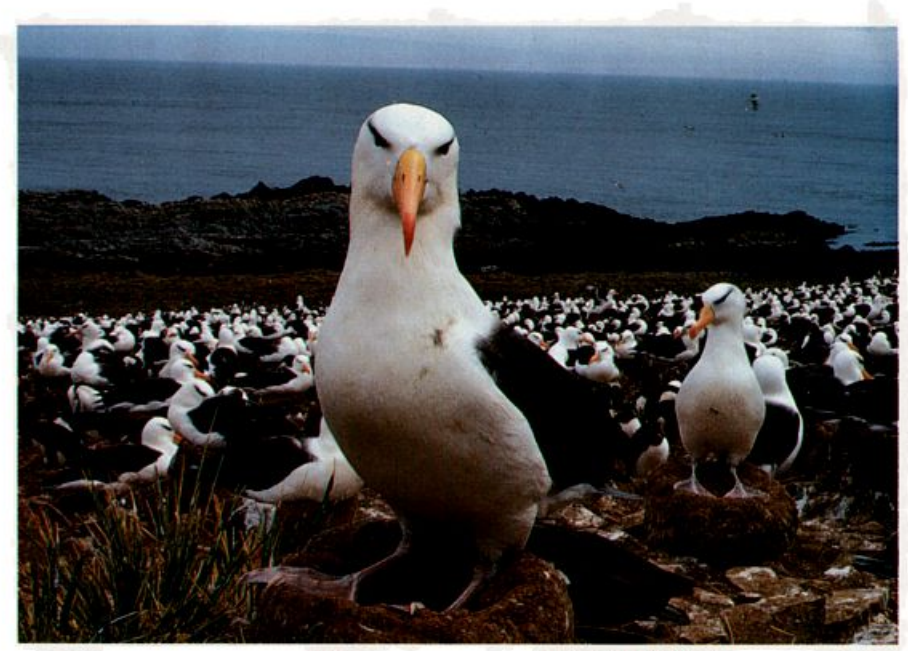
Black-browed Albatrosses are abundant in Falkland waters. The birds nest in several huge colonies, most of which are on the outer islands.

Surely, it is the massive colonies of southern ocean seabirds which first capture the imagination of those interested in birds. Five species of penguin occur: Rockhopper, Gentoo, and Magellanic breeding in large numbers, small colonies of the exquisite King Penguin, and a few lonely Macaroni Penguins hidden amongst the colonies of Rockhoppers which, like the Blackbrowed Albatross, number in the millions. Many Falkland Island seabirds are