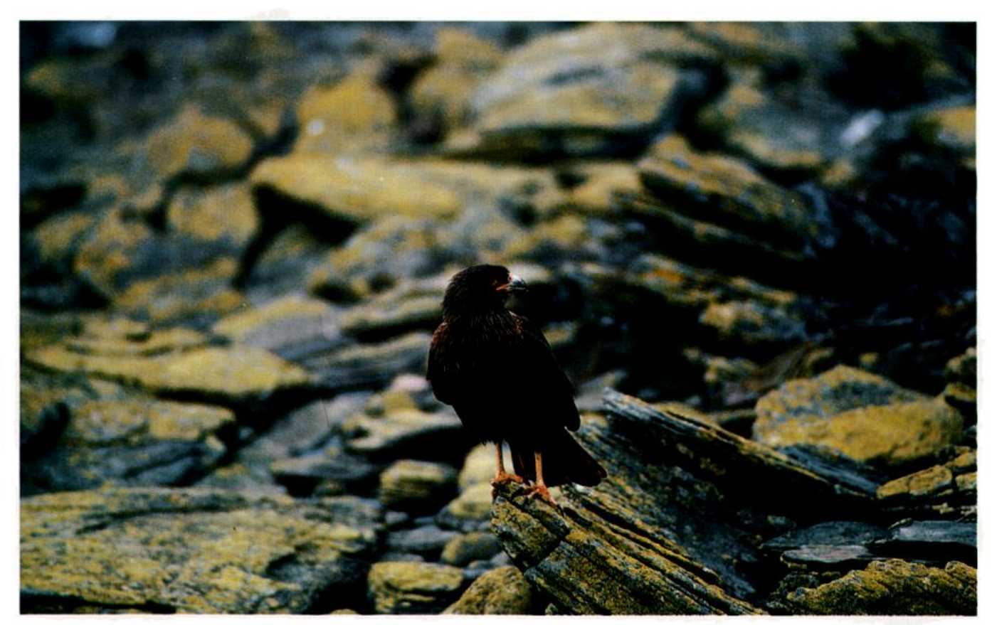
Striated Caracaras are restricted to the Falklands and a few islands off the South American mainland. Ridiculously tame and curious, this bird is one of the rarest raptors in the world.

------ Falkland Islands Tourism Service, 294 Tadcaster Road, York, Y02 2ET England