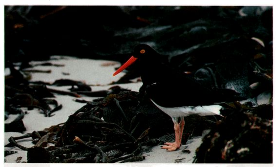
Magellanic Oystercatchers are common breeding birds in the Falklands.