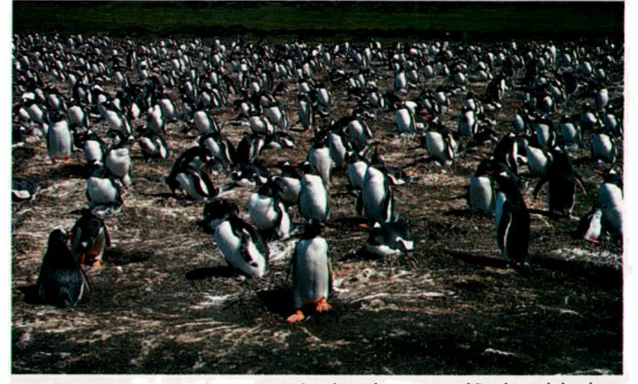
The distinctive Gentoo Penguin is a common breeder in the area around Stanley and elsewhere Photo/Rod Martins.