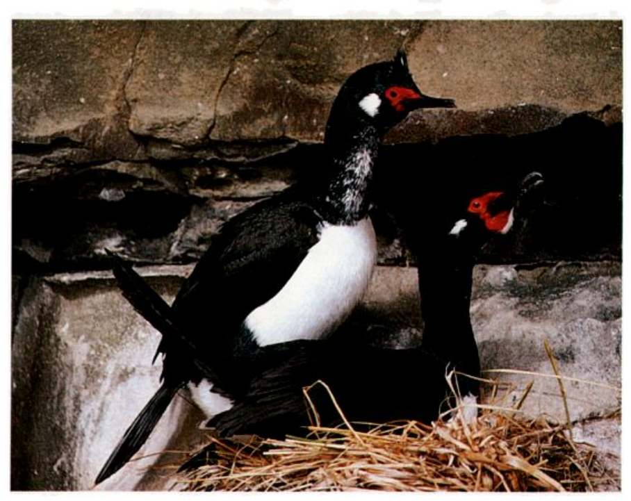
Rock Shags are frequently encountered in coastal waters. This species is widespread throughout the region.