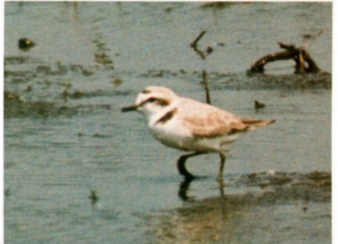
Snowy Plover in Fulton County, Illinois, May 11, 1987. Second Illinois record.