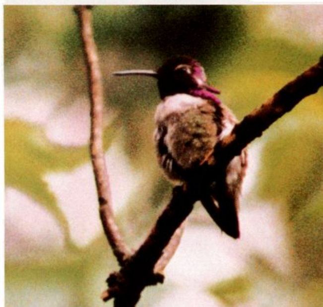
Male Costa's Hummingbird at Burnaby, British Columbia, May 31, 1987. Sixth record for British Columbia.