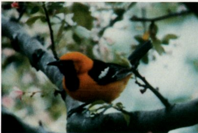
Male Hooded Oriole at Klamath Falls, Oregon, May 2-3, 1987. First for eastern Oregon.