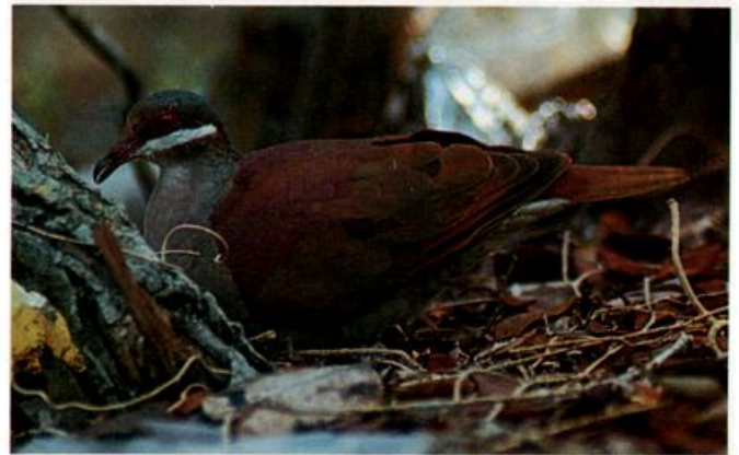
Key West Quail-Dove on Marathon Key, Florida, April 25, 1987.