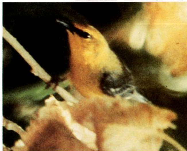
Female Blue-winged Warbler at Butterbredt Springs, California, May 30, 1987.