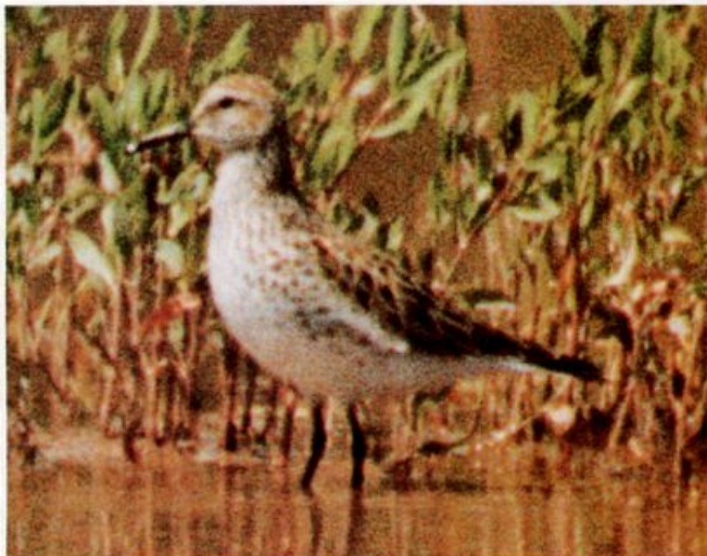
White-rumped Sandpiper at Many Farms Lake, Arizona, May 24, 1987. Second Arizona record.