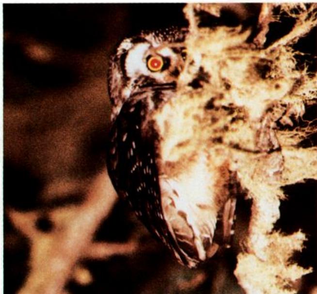
Adult Boreal Owl south of Cumbres Pass, Rio Arriba County, New Mexico, April 19, 1987. First record for New Mexico, and a new southward extension from recently discovered sites in Colorado.