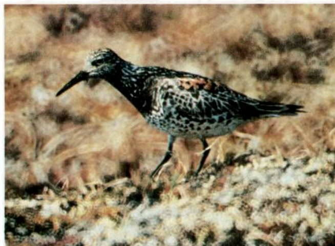
Great Knot at Gambell, St. Lawrence Island, Alaska, June 3, 1987.