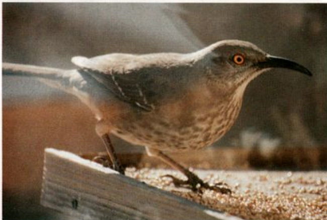
Curve-billed Thrasher at Twin Falls, Idaho, April 11, 1987. First Idaho record.