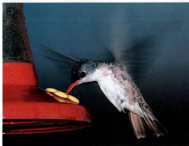
Violet-crowned Hummingbird in Saugus, California, May 26, 1987.