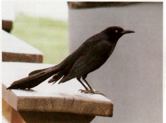
Male Great-tailed Grackle at Union Gap, Washington, May 25, 1987. First Washington record.