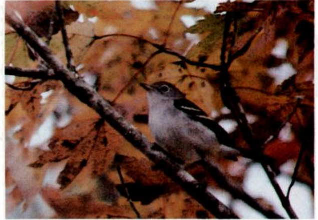
Chestnut-sided Warbler at Jacksonville, Florida, December 26, 1986.