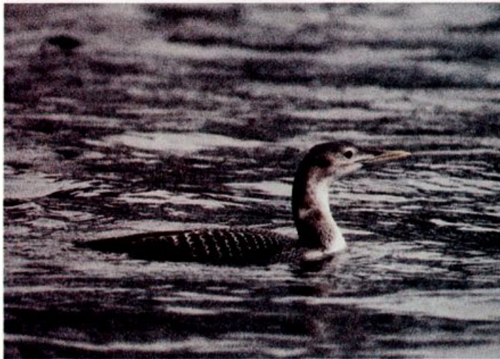
Yellow-billed Loon at Rock Falls, Illinois, December 23, 1986. First Illinois state record. The transverse pale markings on the back indicate that this is a first-winter bird.