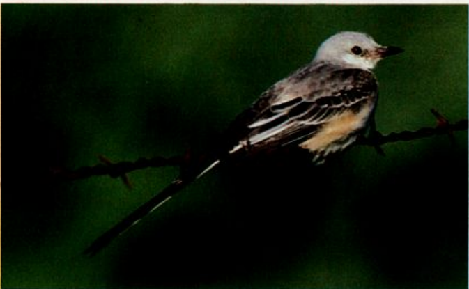
Scissor-tailed Flycatcher at Point Reyes, California, February 7, 1987. First winter record for northern California.