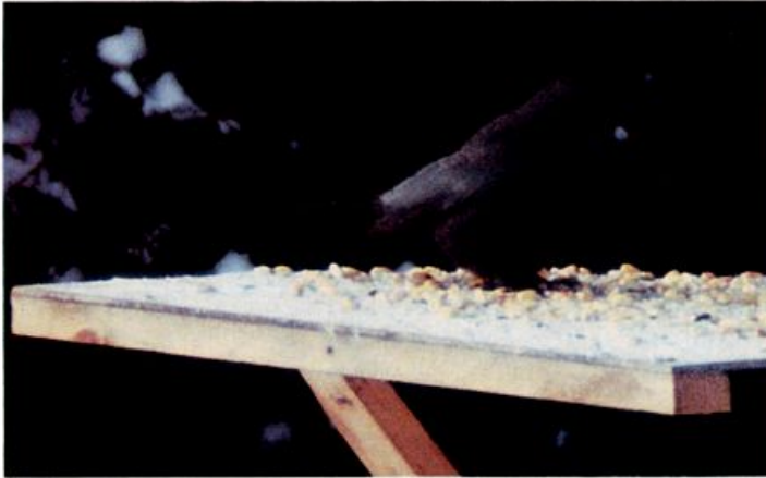
Female Brewer's Blackbird at Victoriaville, Quebec, in the winter of 1986–1987.