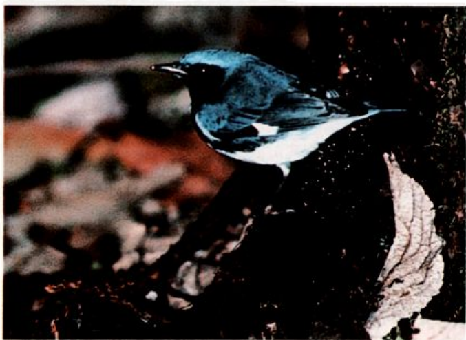
Male Black-throated Blue Warbler at Terre Haute, Indiana, January 1 1987.