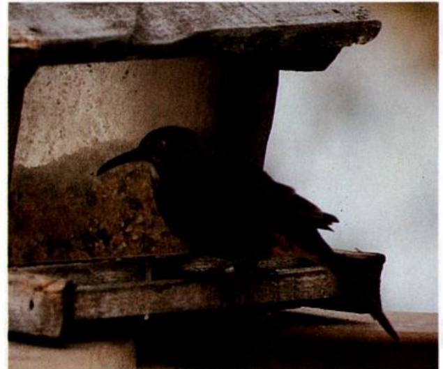
Curve-billed Thrasher at Spencer, Wisconsin, January 1987. Second Wisconsin record.