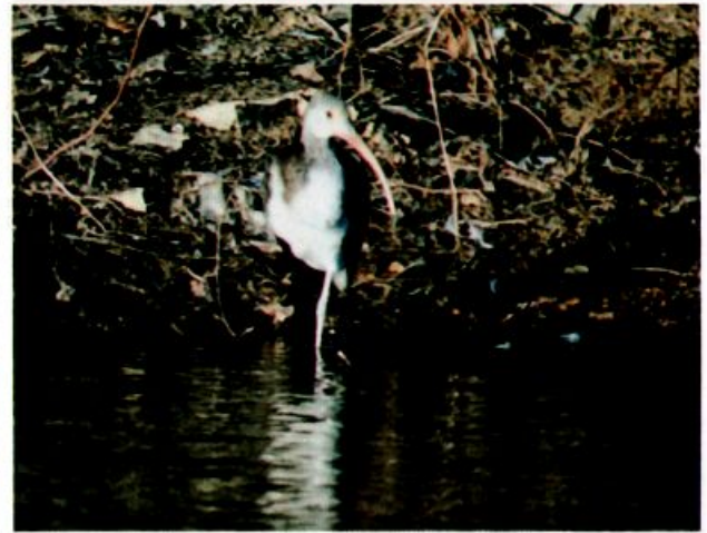
Immature White Ibis on the Roanoke River in Salem, Virginia, January 17, 1987.