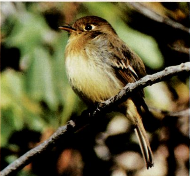
Western Flycatcher in Santa Barbara, Santa Barbara County, December 7, 1986. This bird was present during the early part of the winter, but disappeared in early January.