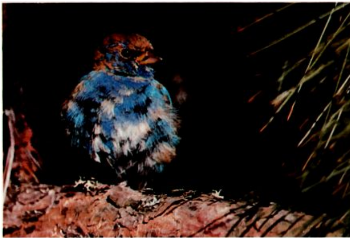
Male Indigo Bunting beginning molt into breeding plumage at Birch Beach, Ontario, February 14, 1987. Photo/W. Zarowski.