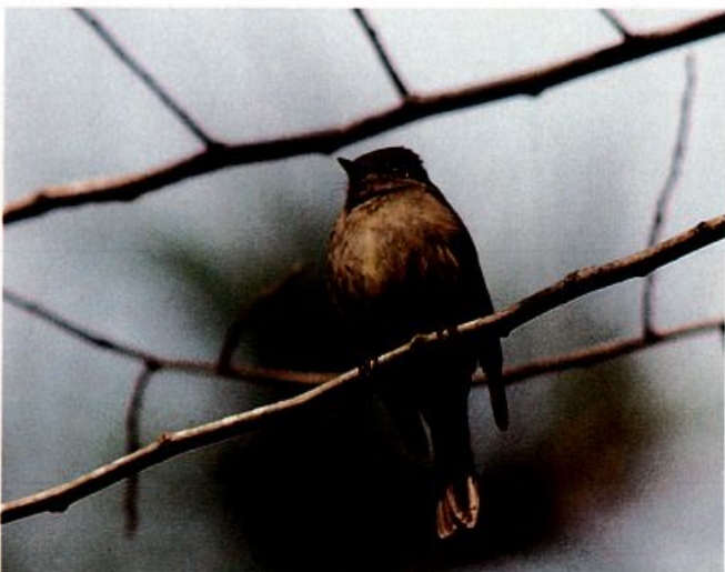
Hammond's Flycatcher in Bastrop County, Texas, February 22, 1987. The small bill and long wingtips were among the characters noted in identifying this first record for eastern Texas.