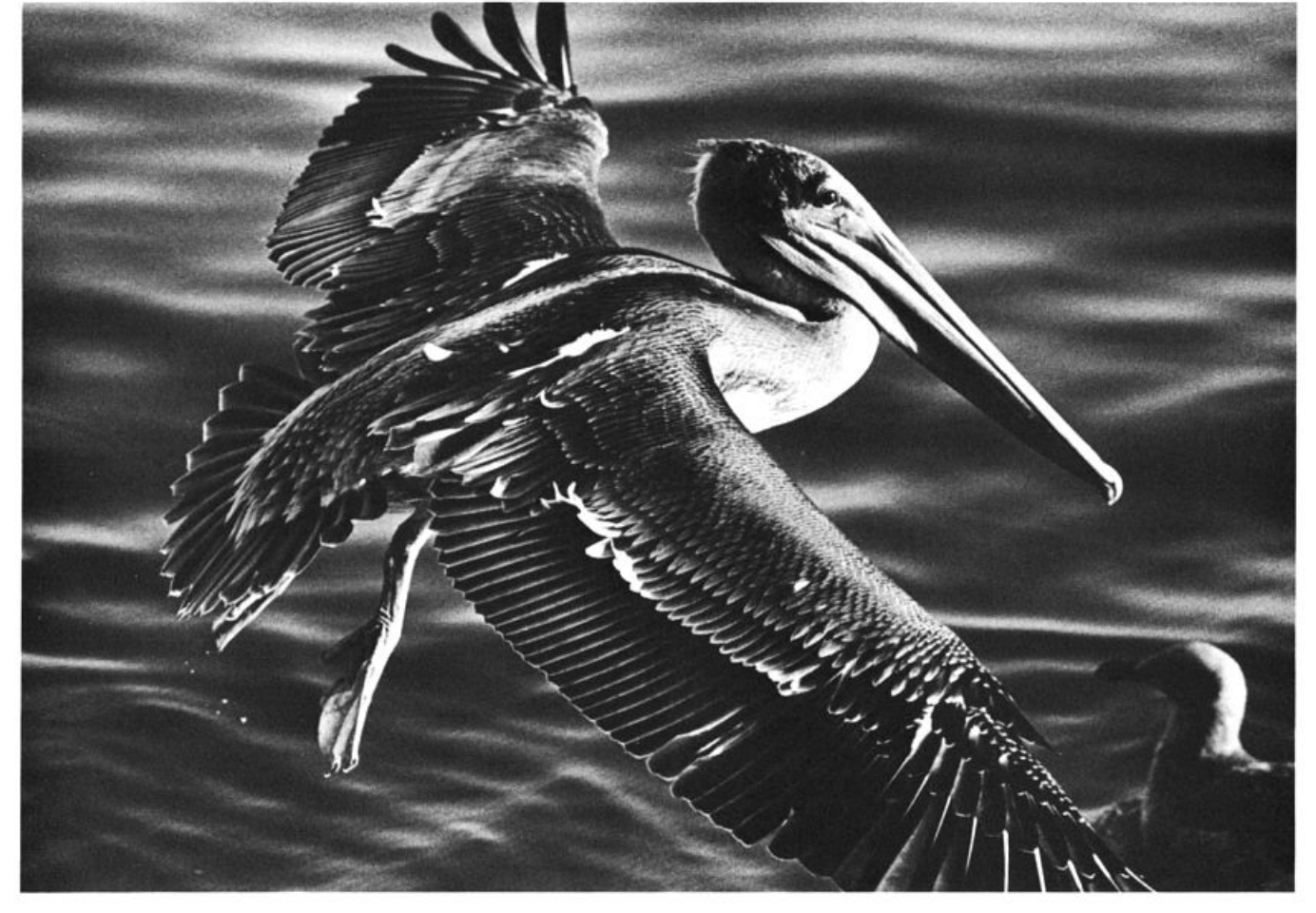
Brown Pelican (Pelecanus occidentalis). Few bird photographers now take black-and-white photographs. Many fewer still specialize in this medium. Kenneth W. Gardiner's continuing success with black-and-white, well-illustrated by this pelican in flight, shows the striking potential of the medium with high-speed equipment.

code for Sanderling, while uTroc015 is that for the Long-Tailed Hermit. Birders and ornithologists can learn the code easily because the family abbreviation is readily identifiable, in contrast to other coding systems based solely on numbers. Printouts or floppy discs (IBM-PC, dBase II data file) of the code for the world's avifauna or for geographic subsets may be obtained from VIREO. Inquiries should be sent to the authors.