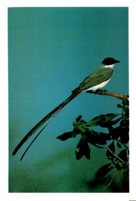
Fork-tailed Flycatcher (Tyrannus savana). Photographed in Rio Grande do Sul, Brazil, by John Dunning. (VIREO d01/2/006).