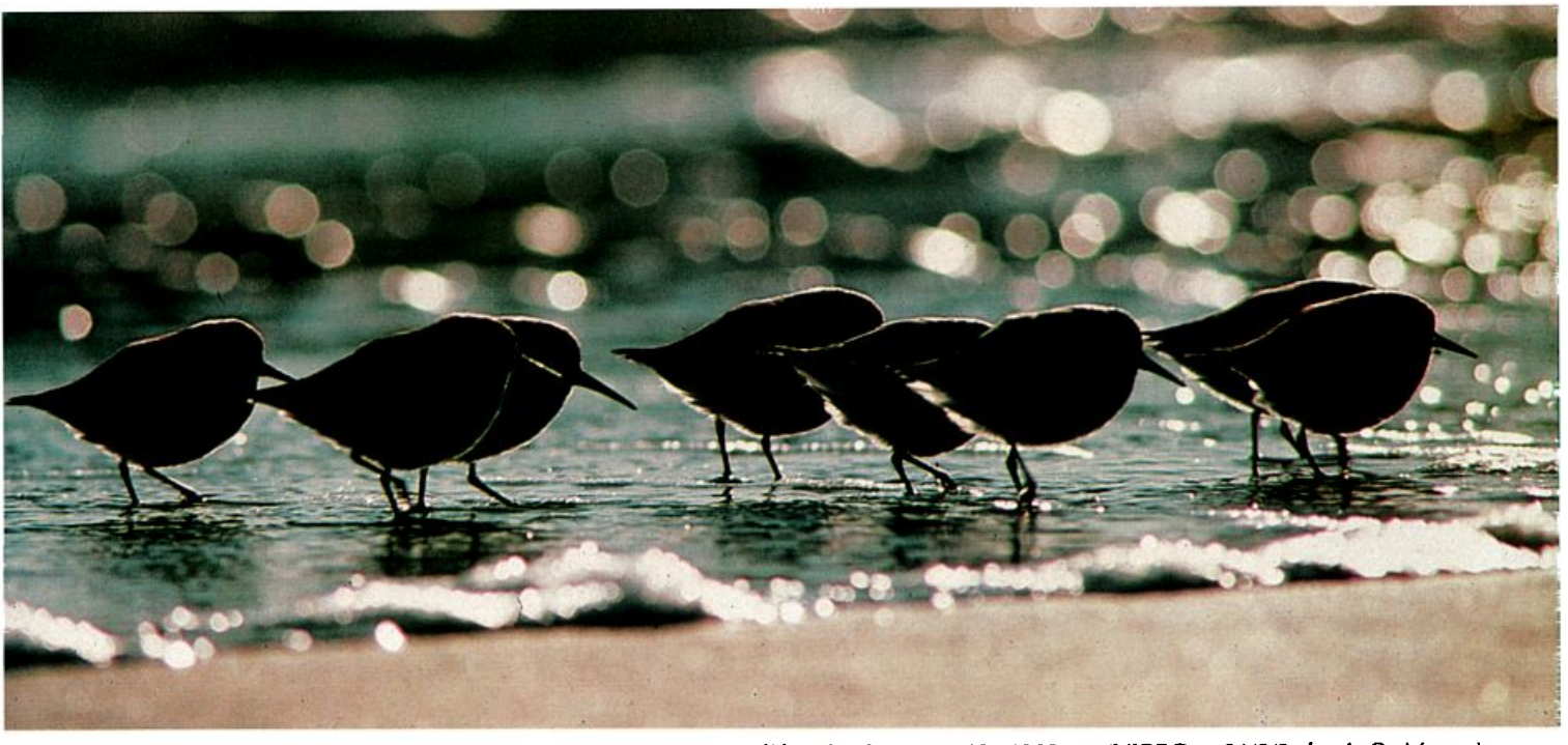
Western Sandpipers (Calidris mauri). Bodega Bay, California, January 12, 1982.