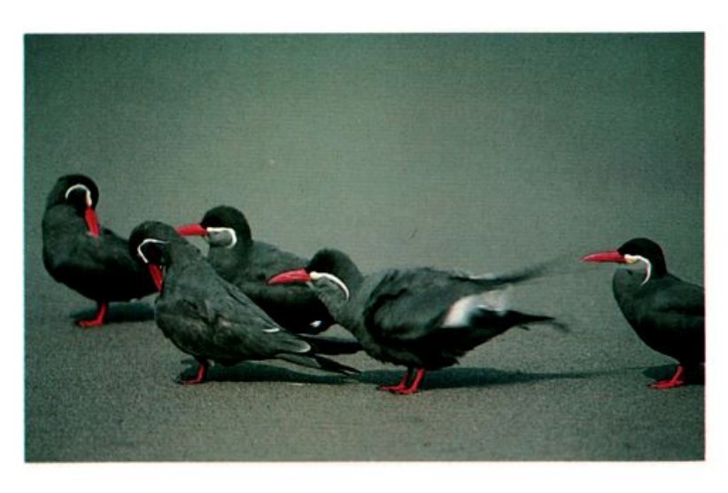
Inca Terns (Larosterna inca). Mejía, Peru, March 16, 1983.