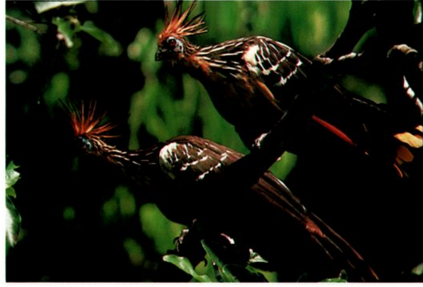
Hoatzins (Opisthocomus hoazin). Photographed by Charles Munn in Manu National Park, Peru. (VIREO m09/1/025).