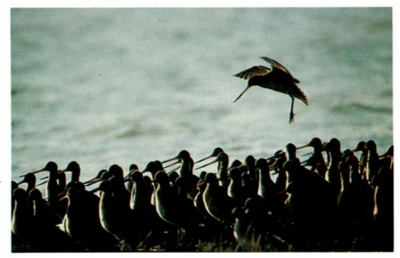
Marbled Godwits (Limosa fedoa). Bodega Bay, California, September 20, 1981. (VIREO m01/99/10, by J. P. Myers).