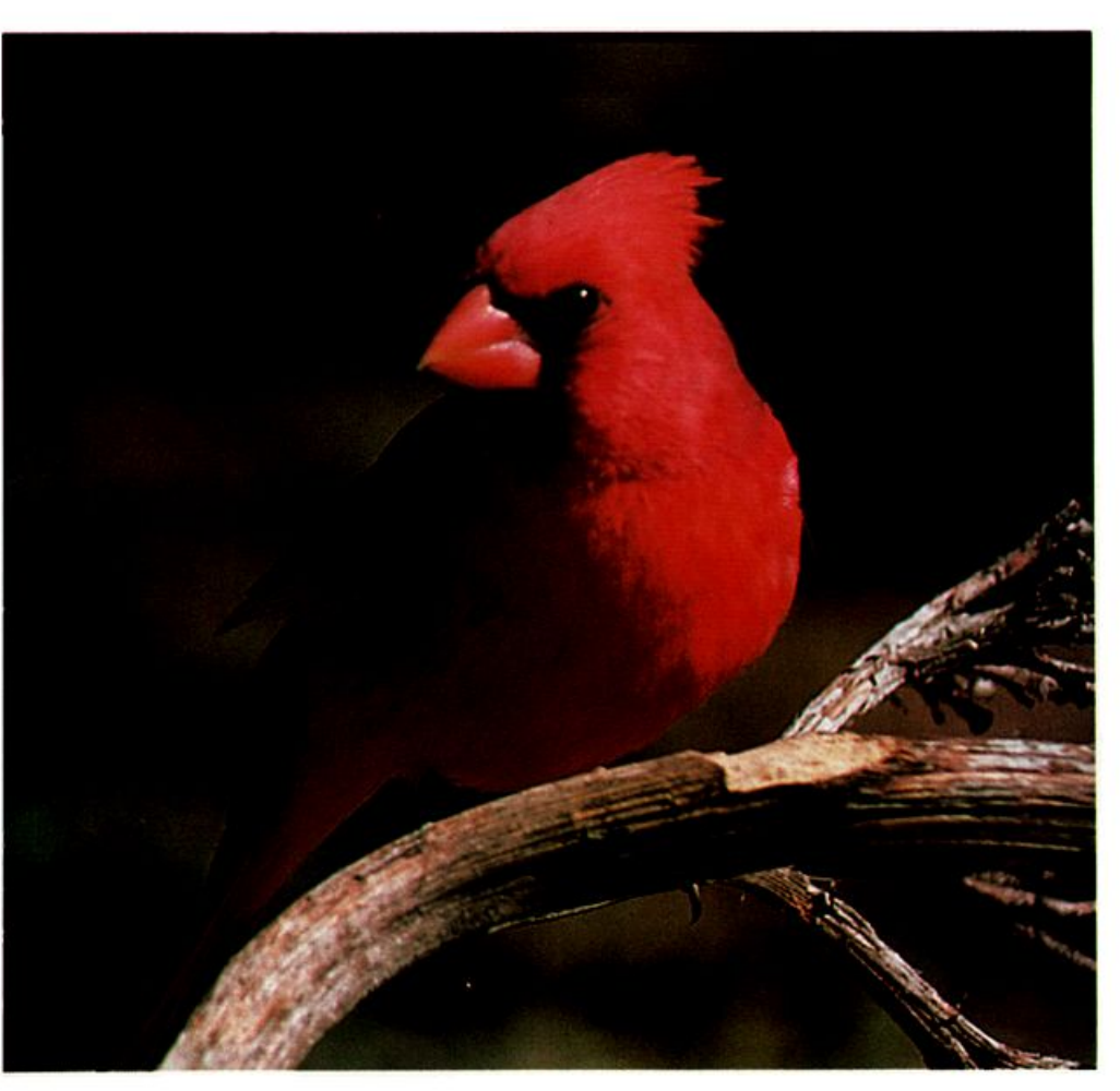
Northern Cardinal (Cardinalis cardinalis). Long series of photographs of common North American birds form the core of VIREO's collections. Photograph by Helen Cruickshank. (VIREO c03/99/010).

Ross' Gull (Rhodostethia rosea). VIREO acts as a repository for photographs documenting significant ornithological records. This gull, photographed by R. Mellon in June 1981, took part in the dramatic range expansion of Ross' Gulls first documented by Chartier and Cooke in American Birds 34:839-841. (VIREO m05/1/43).