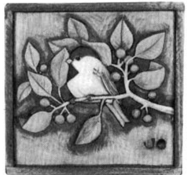
Chickadee — 8" x 8"

S TRICTLY WOOD presents its Limited Edition Series of Wood Relief Carvings. Noted woodcarver, Jack Olson has created 2 wall plaques especially for bird lovers; 'Chickadee' & 'Bluebird'. These 8" x 8" plaques are carved in butternut, painstakingly finished by hand and delicately colored with an oil stain.