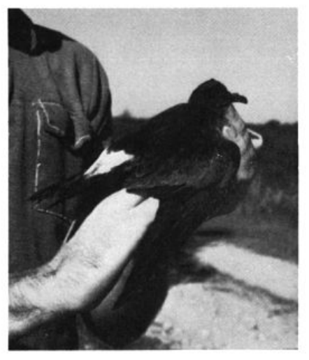
Fig. 1. Leach's Storm-Petrel at Eufaula N.W.R., Ala., Oct. 7, 1978. Note tubenose, deeply forked tail, v-shaped white rump bisected by gray stripe, and long wings with pale wingbar.

Since there was no inclement weather prior to the bird's discovery, its appear-