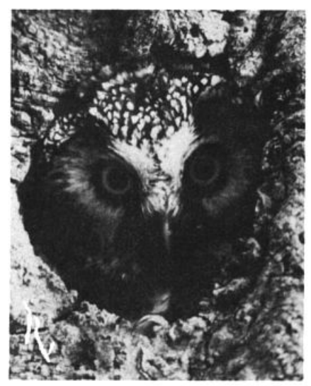
Female Boreal Owl in nest hole. Cook County, Minnesota. June - July, 1978. To replace photo in AB 33:135.

ogies to the two authors, the error would have been avoided had they submitted the fine photograph below in time for publication.