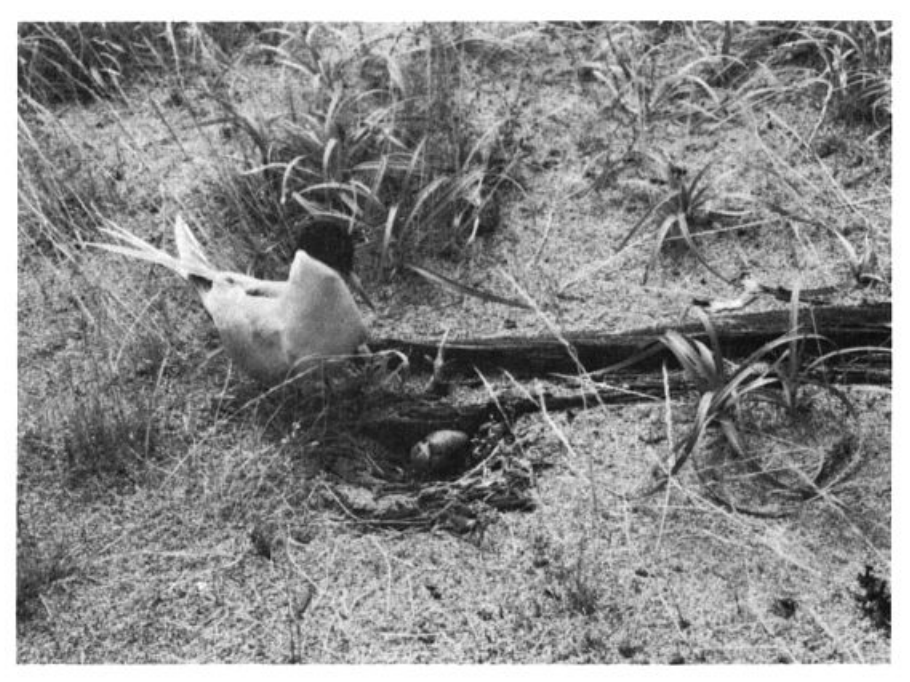
Fig. 2. Incubating Arctic Tern on Jetty Island, Washington.

higher at the northern shrub-covered end and grading toward a central and southern grass-covered portion. It is currently being used as an undeveloped recreation area by the Port of Everett. The number of visitors during the summer season appears to be low; however, despite easy access to the island. Owing to more intensive recreational use in the