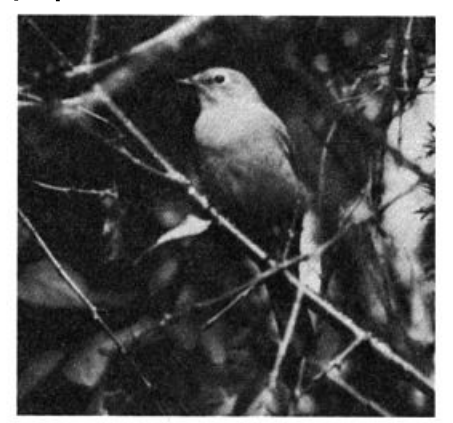
Townsend's Solitaire. Warren, R.I. November, 1978.

trast between back and belly, the small dark bill, and least obvious of all, thin white outer tail feathers. When it flew, the orange wing patches became particularly prominent. The flight was quite distinctive, being rather slow and erratic. Each flight was of short duration as it moved alternately from the tops of deciduous trees to the lower branches of junipers.