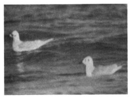
Fig. 2. Note pale mantle and size comparison with nearby Bona parte's Gull.