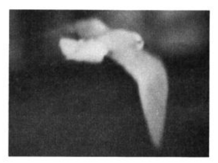
Fig. 3. Wedge-shaped tail is evident.