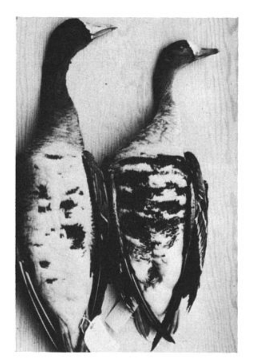
Size comparison of Tule and White-fronted Geese.

THERE ARE OTHER PIECES of evidence also. that the Tule Goose is unique. Through field study it was determined that Tule Geese on the Sacramento Refuge flock together but apart from the common White-fronteds. Thus, they behave as a distinct population unit on their California wintering grounds. Also, it has become apparent that Tule Geese are unique to the Pacific Flyway. Measurements taken from geese in the Central Flyway are comparable only with the smaller western form of White-fronted. One of the most curious finds is that Tule Geese display on their forehead an orange feather stain which is probably acquired while they feed on aquatic vegetation somewhere in the muskegs of the northern breeding grounds. The usual absence of stain on the common White-fronted suggests that differences in feeding patterns exist. Field observations have already indicated that Tule Geese prefer to bottom-feed on aquatic vegetation, whereas the smaller form grazes primarily on