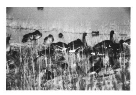
White-fronted Geese including possible Tules.

sity of California, Berkeley, the opportunity was made available to me by a local duck and goose hunt club which funded the study in the interests of conservation.