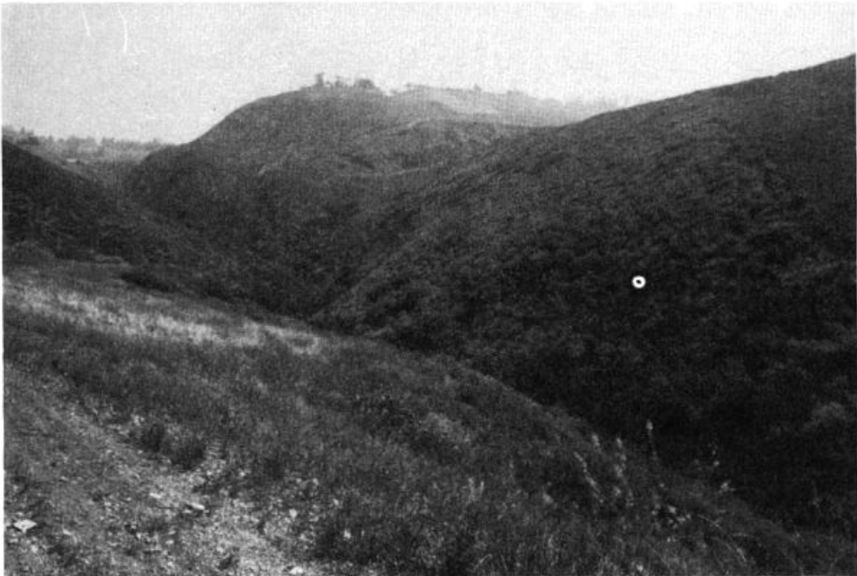
Census 149, page 106. Undisturbed Coastal Sage Scrub.