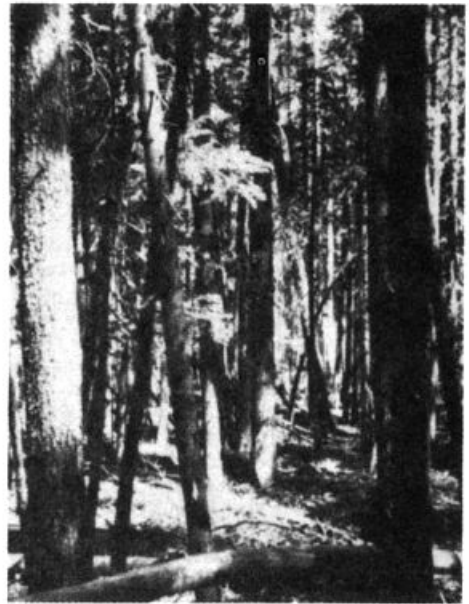
Census 135. Under canopy on Subalpine Conifer Forest Plot.