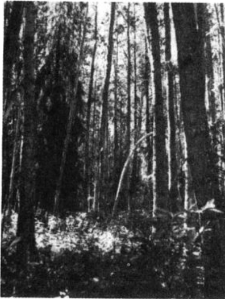
Census 133. Scattered spruces with dense shrub layer.