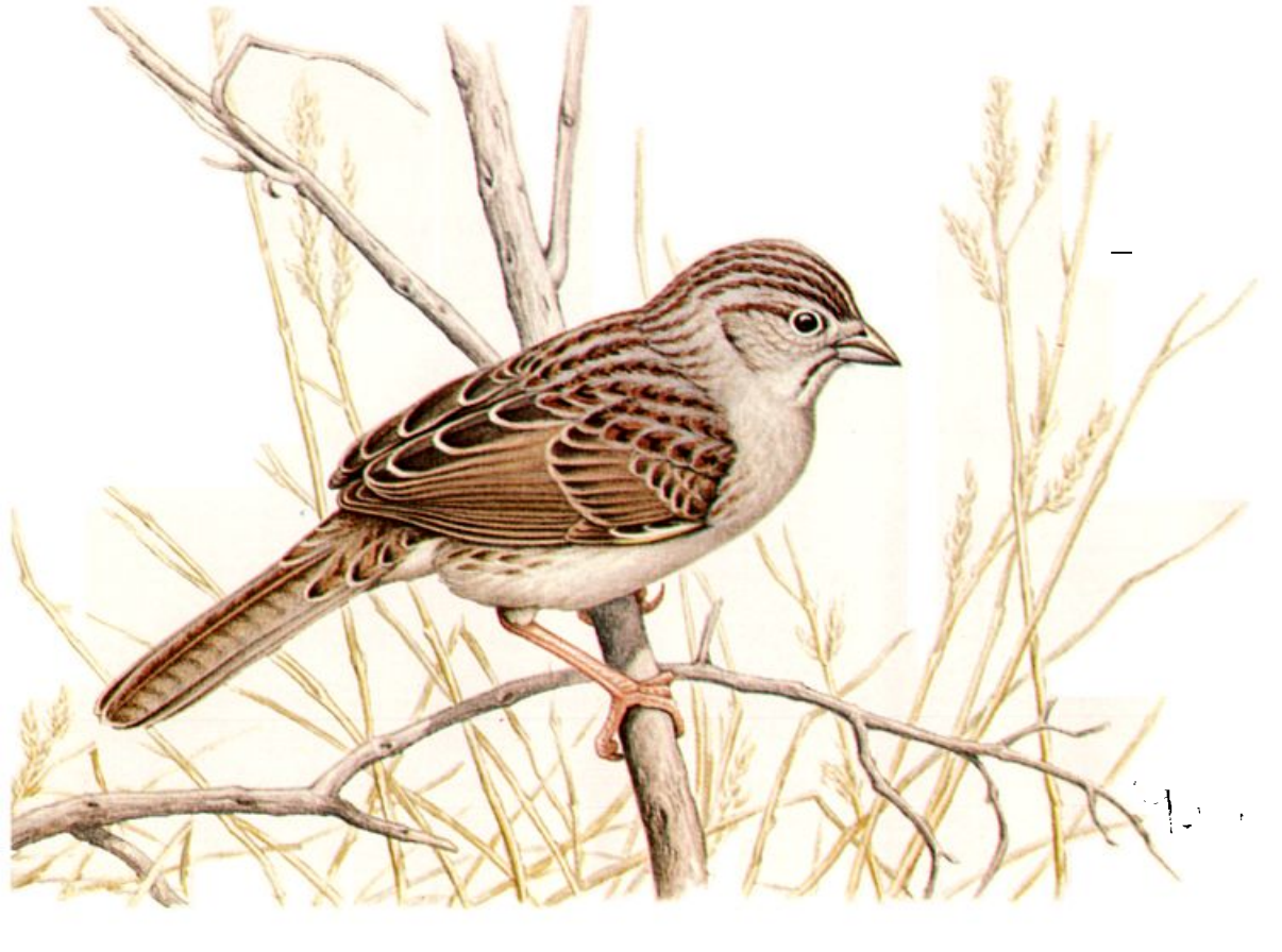
Cassin's Sparrow. Painted for American Birds by Guy Tudor

(1944) showed—but apparently not to the satisfaction of the 1957 A.O.U. Check-list Committee—Cassin's Sparrow is not to be equated with most temperate zone passerines, at least in Arizona.