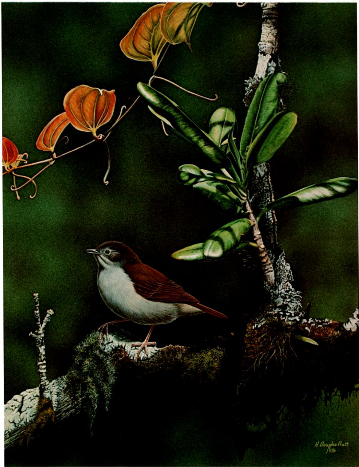
Puaiohi, or Small Kauai Thrush, Phaeornis palmeri , painted in Alakai Swamp, Kauai. Tree is a Pelea , sp. The vine is Smilax sandwicensis .