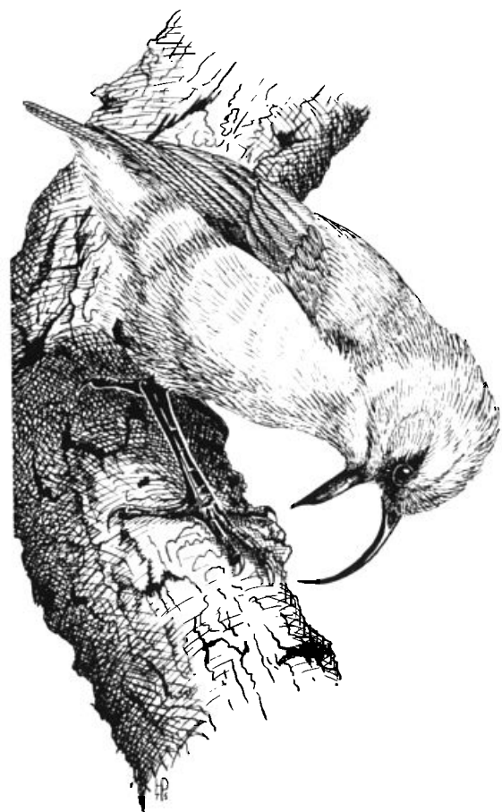
Akiapolaau, Hemignathus wilsoni.

become thoroughly familiar with both the vocalizations and visual identifying marks of all species concerned. With but one exception (see below), he at no time during his earlier studies saw anything comparable to the activity and numbers of birds witnessed on August 19.