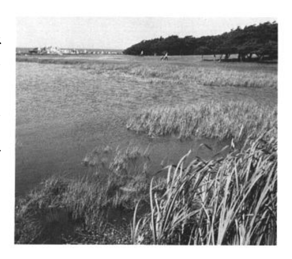
A. Crespi Pond and Golf Course at Pt. Pinos. Emergent vegetaton holds Sora and Virginia Rails (Aug.-Mar.) Cypress Grove trees shelter many rare "eastern" vagrants (Sept.-Oct.).

Oak woodland, redwood canyon and interior grassland habitats are typical of interior valleys of central California, away from the coast. The finest example, close to the Peninsula, is enhanced by its scenic beauty. Robinson Canyon is a tributary valley cut in the south flank of Carmel Valley. It is reached by proceeding east on Carmel Valley Rd. 6 miles from Hwy. 1 turning south across the river on Robinson Canyon Rd., then proceeding for 9 miles. The valley is threaded by a narrow road which twists its way up through coastal redwood groves, oak forest, then out onto oak-studded grasslands successively.