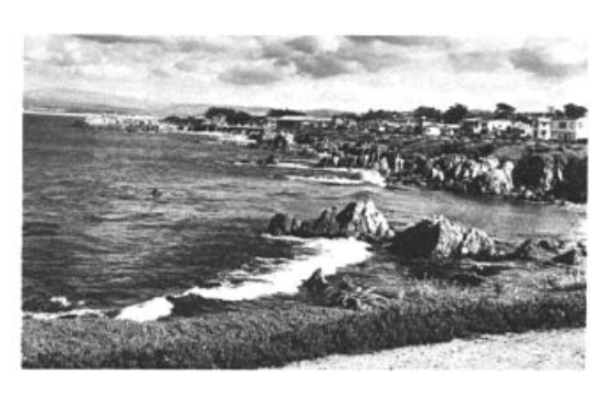
B. Sheltered waters at Lovers' Pt., Pacific Grove. Loons grebes, sea ducks and Black Turnstone found here

The sheltered coastal waters of Monterey and Carmel Bays are wintering places for numerous loons, grebes cormorants, sea ducks, gulls and alcids and may be viewed with great ease in the vicinity of Monterey Harbor. There the Coast Guard breakwater and Municipal Wharf (not Fisherman's Wharf) are excellent elevated vantage points. Note that Arctic Loons far outnumber the two other species, although they often feed further out in deep water. Yellow-billed Loons have been sighted for several successive winters. Continued observation of this inshore species should be possible from a little greater distance, with the essential scope. Excellent sites are off nearby Cannery Row in Monterey and Ocean View Blvd. in Pacific Grove, especially in the vicinity of Lover's Pt. and Otter Pt. The latter site features another Peninsula speciality, the sea otter.