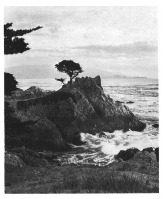
C. Midway Pt., Pebble Beach, looking across Carmel Bay to Pt. Lobos State Reserve and Santa Lucia Mts beyond. Foraging area for Brandt's Cormorant, smaller grebes, phalaropes, sea otters. Endemic Monterey Cypress, foreground.

The open ocean around Monterey Bay is famous for the extensive variety and numbers of north Pacific marine birds. Oceanic conditions occur close to shore, with the 500 fathom line less than 10 miles from Pt. Pinos Spring and early summer upwelling of enriched cold waters result in an abundance of zoonlankton and small schooling fishes in the fall. Under normal circumstances the best course for a pelagic birding boat to follow is due west from Pt. Pinos. 10-12 miles, then north towards Santa Cruz, then due east over the north rim of the immense Monterey Submarine Canyon until approximately 6 miles off Moss Landing, finally heading back towards the Peninsula. August through October is the period of greatest avian variety Northern Fulmar, Flesh-footed, New Zealand and Sooty Shearwaters, Ashy and Black Petrels, Red and Northern Phalaropes, Pomarine and Parasitic Jaegers, Sabine's Gull, Arctic Tern, Common Murre, Pigeon Guillemot and Cassin's Auklet are all common to abundant. Black-footed Albatross is more common from January through July, than August through December. In addition