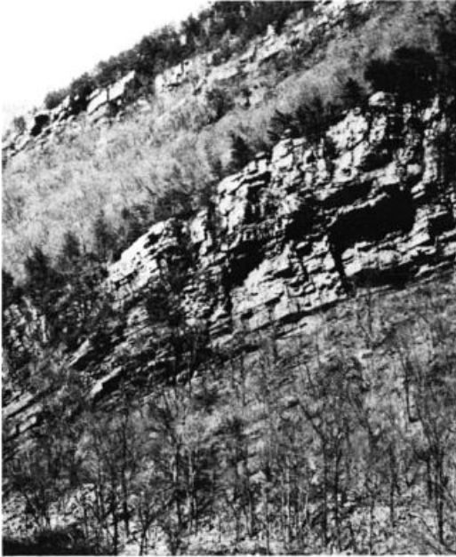
Fig. 2. A 120-foot quartzite cliff. Ravens nested under the overhang right.

In 1972, 40 square miles of mountains with few cliffs northwest of the main study area were searched for tree nests but none were found. Ground searches for tree nests were so inefficient that the results were inconclusive and the area was excluded from the data presented.