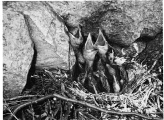
Fig. 3. Nestlings are protected from March weather by rocky projections.

The distance from each active nest to the next closest active nest was measured and a mean distance to the nearest active nest was computed. To determine the boundary of the study area, we used one-half the mean distance to the nearest active nest as a radius from each active and potential nest site. The probability that an undetected active raven nest occurred in the study area was very low.