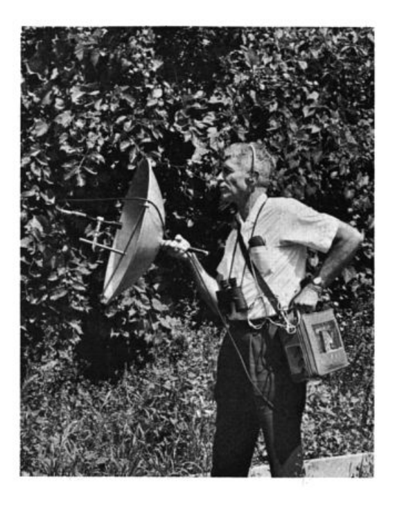
The author in the field, equipped with tape recorder and parabolic reflecter microphone.

To the ear, a Chipping Sparrow song appears to be a rapid series of similar notes, uttered too fast to count, with a somewhat mechanical quality. The accompanying graph shows a part of one song of this species (not all Chipping Sparrow songs are exactly like this one). The notes in this song are uttered at the rate of about 18 per second, and each note consists of an abrupt downslur followed by an even more abrupt upslur; the upslur, over nearly an octave, takes place in about 0.01 second. It is the very rapid slurring that gives this song its mechanical quality.