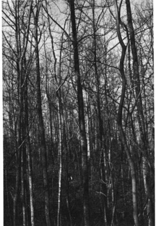
Study 10. Upland Tulip-tree-Maple-Oak Forest, Maryland.

The morning trips started at local sunrise; the afternoon trips were finished between 20 minutes and 0 minutes before sunset. Count: Carolina Chickadee, 6 (50, 21); Downy Woodpecker, 3 (25, 10); Golden-crowned Kinglet, 3 (25, 10); Cardinal, 3 (25, 10); White-throated Sparrow, 3 (25, 10); Tufted Titmouse, 2 (17, 7); Carolina Wren, 2 (17, 7); Am. Goldfinch, 2 (17, 7); Red-bellied Woodpecker, 1 (8, 3); Yellow-bellied Sapsucker, 1 (8, 3); Hairy Woodpecker, 1 (8, 3); Blue Jay, 1 (8, 3); White-breasted Nuthatch, 1 (8, 3); Brown Creeper, 1 (8, 3); Winter Wren, 1 (8, 3); Purple Finch, 1 (8, 3); Dark-eyed Junco, 1 (8, 3); Red-tailed Hawk, +; Red-shouldered Hawk, +; Mourning Dove, +;