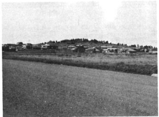
Study 22. Isolated Ponderosa Pine Forest, Colorado. On left, site in 1961. On right, same site 1973.