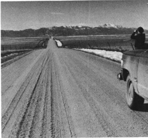
Study 37. High Plains Grassland, Colorado.