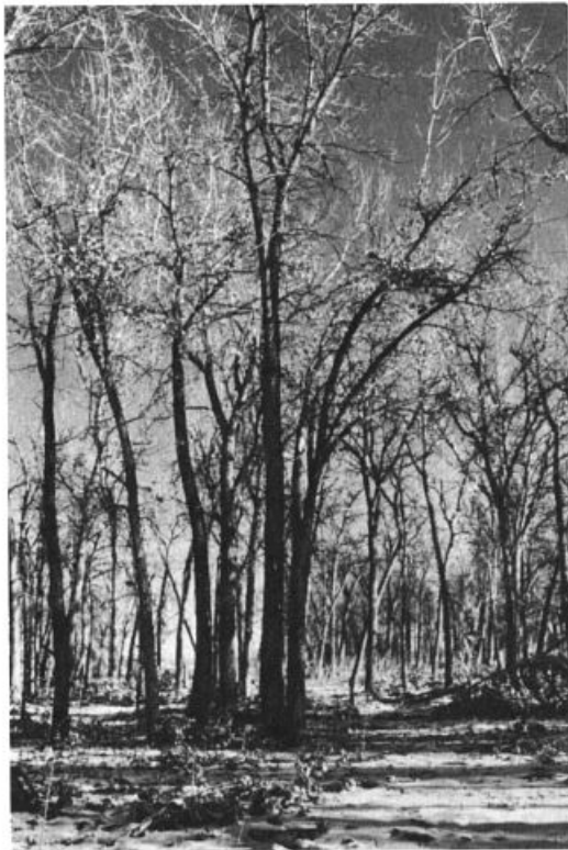
Study 30. Floodplain Cottonwood Forest, Colorado.

— Location: In Jefferson County, Colorado, on the South Platte River about 10 miles southwest of Denver; 39°32'N, 105°5'W, Littleton Quadrangle, USGS. Continuity: Established 1972. Size: 9.7 ha = 24 acres. Description of Area: See AB 25:966 (1971). Weather: During December and January the ground remained covered with depths of snow varying from 6 in. to 2 ft. By February the snow had mostly gone. December was unusually cold and snowy. Coverage: Jan. 6, 11,