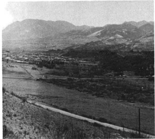
Study 38. Foothills Cottonwood Creek-bottom and Brushland, Colorado. General view.

there is no permanent water on the census acreage. Edge: There is a sedimentary hogback to the west, covered with shrubs and a scattering of pinyon and juniper. To the south are the White House Ranch buildings and landscaping and beyond a housing development, while the eastern side of the census area borders on a misused "old field" belonging to the Ranch. North of the Garden of the Gods entrance road the ecosystems are an extension of the census acreage. Weather: The census period followed a very cold, snowy and windy autumn, but was in itself fairly moderate. The average temperature was about 32°F., with a low of -5° and a high of 58°. Snowfall totaled about 3.1 in. Coverage: Jan. 10, 13, 16, 19, 21; Feb. 25. Total: 6 trips, averaging about 1 hour each, both morning and afternoon. Count: House Finch, 34 (560,