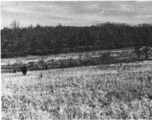
Study 47. View facing east. Foreground to background: Zones 3, 4, 2.

ranged from 17° to 50°F. while wind speeds varied from 0 to 30 mph. Precipitation for December and January was 60% above normal. Average temperatures for these two months were about 3° above normal. (Precipitation and temperature averages from New York City, all other data from home weather station). Coverage: Dec. 3, 11, 17, 24, 27, 31; Jan. 6, 13, 20, 25, 29; Feb. 10. Total: 12 trips, all counts taken between 0830 and 1100, averaging 70 minutes each. Count: Dark-eyed Junco, 13 (84, 34); Starling, 6 (39, 16); Tree Sparrow, 4 (26, 10); Blue Jay, 2 (13, 5); E. Meadowlark, 2 (13, 5); Am. Goldfinch, 2 (13, 5); Com. Flicker, 1 (6, 3); Downy Woodpecker, 1 (6, 3); Com. Crow, 1 (6, 3); Black-capped Chickadee, 1 (6, 3); Tufted Titmouse, 1 (6, 3); Mockingbird, 1 (6, 3); Am. Robin, 1 (6, 3); Cardinal, 1 (6, 3); Purple Finch, 1 (6, 3); Song Sparrow, 1 (6, 3); Am. Kestrel, +; Red-tailed Hawk, +; Roughlegged Hawk, +; Mourning Dove, +; Ruffed Grouse, +; Ring-necked Pheasant, +; E. Phoebe, +; White-breasted Nuthatch, +; N. Shrike,