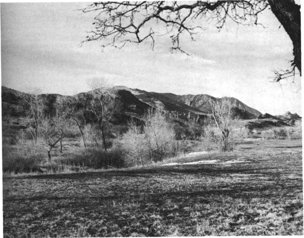
Study 38. Looking northwest across Camp Creek.