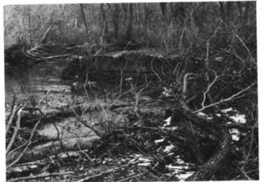
Study 9. Hickory-Oak-Ash Floodplain Forest, Maryland. Two views.