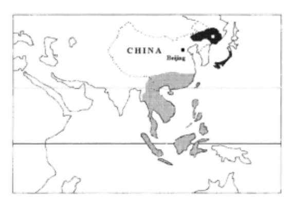
Figure 1. The distribution of the Grey-faced Buzzard. Dark shading indicates breeding range; grey shading indicates winter ranges. The white square indicates the study area.

their breeding season in Zuojia Nature Reserve, northeastern China. Because of these survey efforts, the species is known from more localities than ever before in China (Deng et al. 1997). Feng et al. (1991) estimated the population at a maximum of 30 breeding pairs in Zuojia Nature Reserve and 1000 breeding pairs in northeastern China. The species occurs either in conifer forests, broad-leaf forests, or mixed forests. Grey-faced Buzzards are summer residents in this area. A variety of reports suggest that most Grey-faced Buzzards that breed in northeastern China migrate to Okinawa, Taiwan, the Philippines, Indonesia, and Malaysia for wintering (Ching et al. 1989, Severinghaus 1991, Deng et al. 2003).