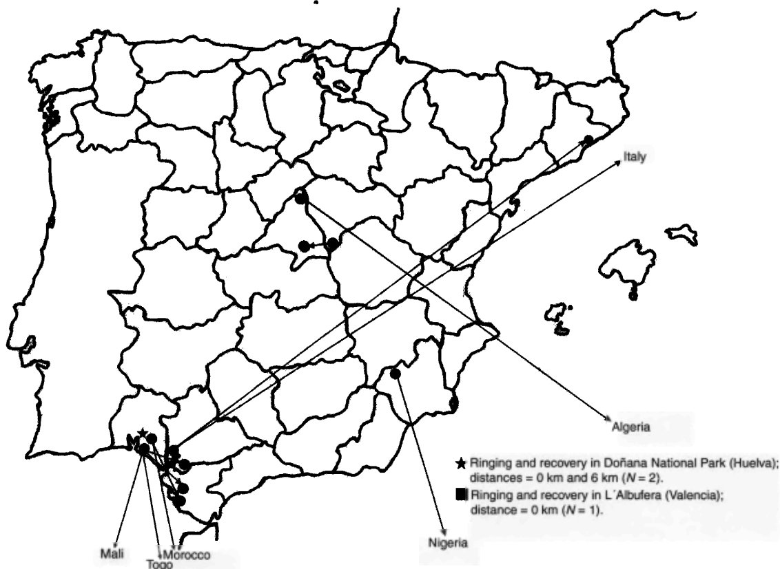
Figure 4. Ringing and recovery localities during winter (15 November–14 February) of Booted Eagles marked in Spain. Recoveries within Balearic Islands, where the species is sedentary, have been excluded.

2-yr old ( N = 2 ) recovered very far from their birthplace during the following breeding season (locations of recoveries were Algeria, Burkina Faso, Mali, and Morocco). The recovery distances were significantly different among age classes (ANOVA with log-transformed dispersal distances; F_{2,29} = 3.9 , P = 0.035 ; Fig. 2), and this suggests that probably young eagles tend to disperse further from their natal area than immatures or adult birds during breeding season. In other raptors, the proportion of individuals found near their natal areas increase with age, and young disperse greater distances in the breeding season (Newton 1979).