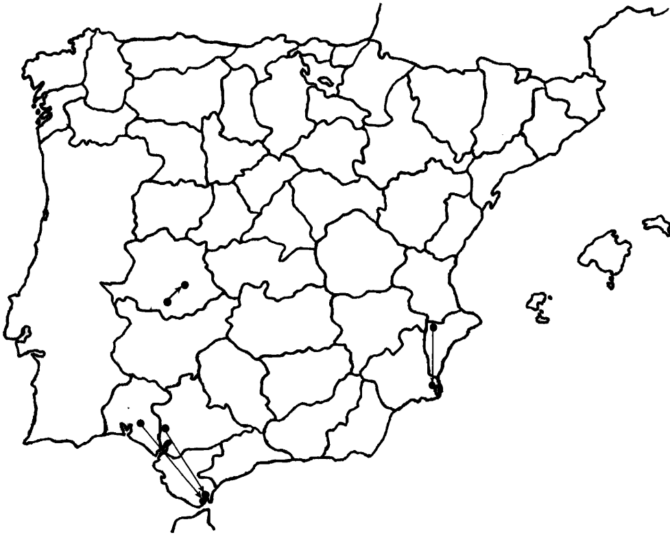
Figure 3. Ringing and recovery localities (filled circles) during autumn migration (15 September–14 November) of Booted Eagles marked in Spain. Recoveries within Balearic Islands, where the species is sedentary, have been excluded.

including within Spain, where illegal predator control is still an important conservation problem (Villafuerte et al. 1998).