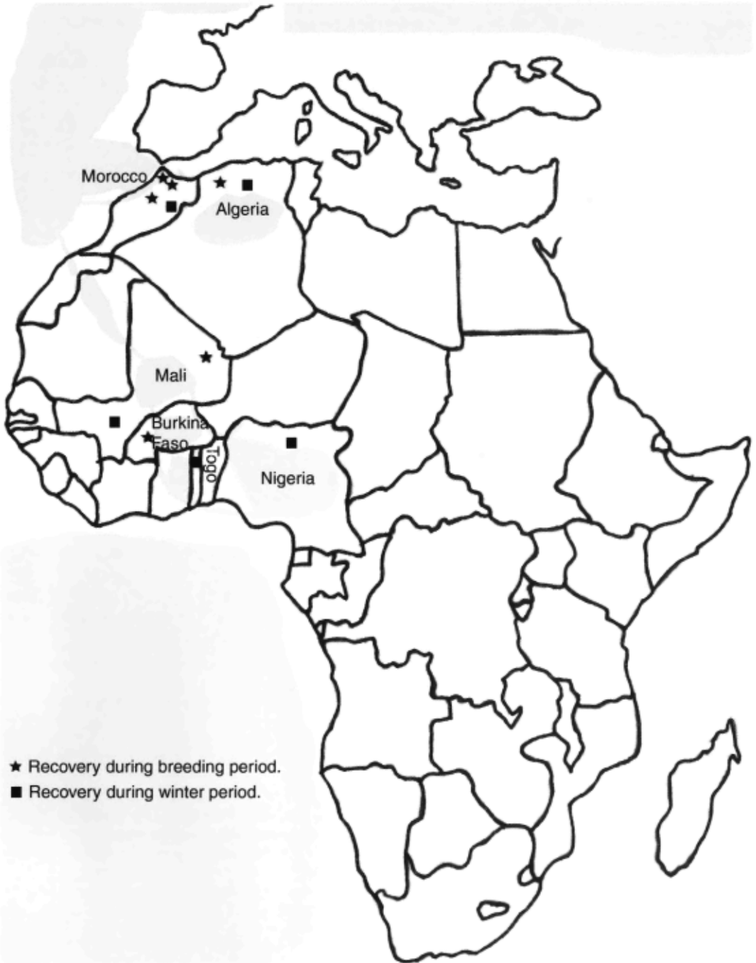
Figure 5. Recovery locations of Booted Eagles during breeding and winter periods in Africa.