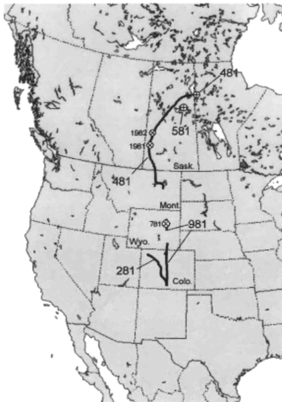
Figure 2. Partial migration routes of radio-tagged adult Bald Eagles from winter ranges in the San Luis Valley, Colorado in 1978 and 1980. Numbers indicate eagle designation and year (Table 1). Summering area of eagle 380 is indicated by ⊕ (confirmed nest location).