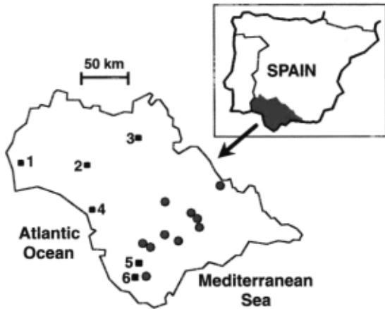
Figure 1. Study area in southwestern Spain, 1998. Grey circles represent the ten territories of Bonelli's Eagles, and numbered black squares are the six sites of prey availability counts.