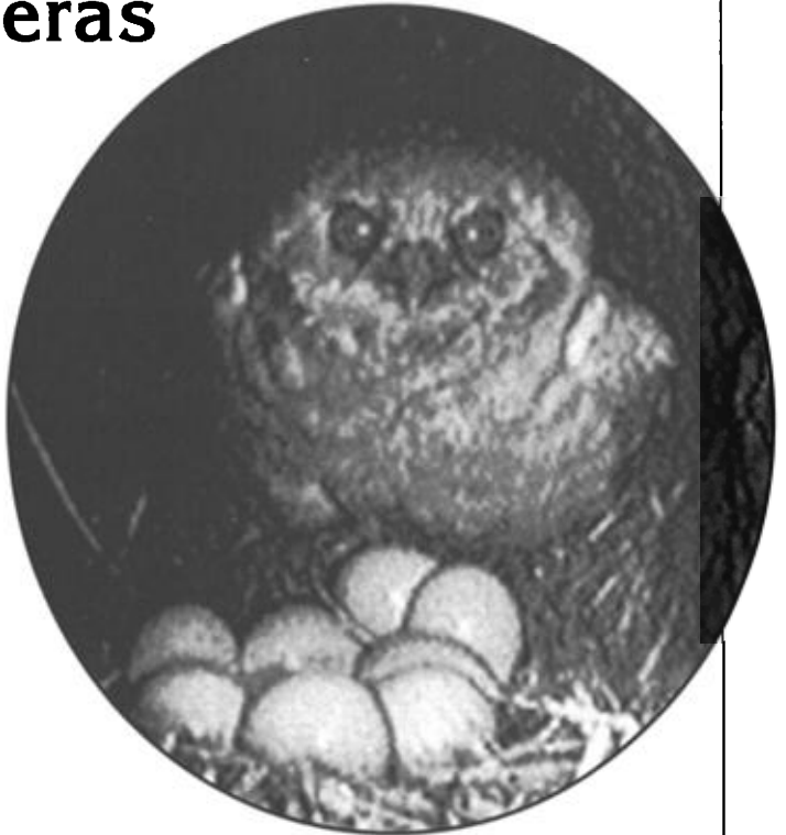
BURROWING OWL WITH EGGS Image captured with the Peeper Video System