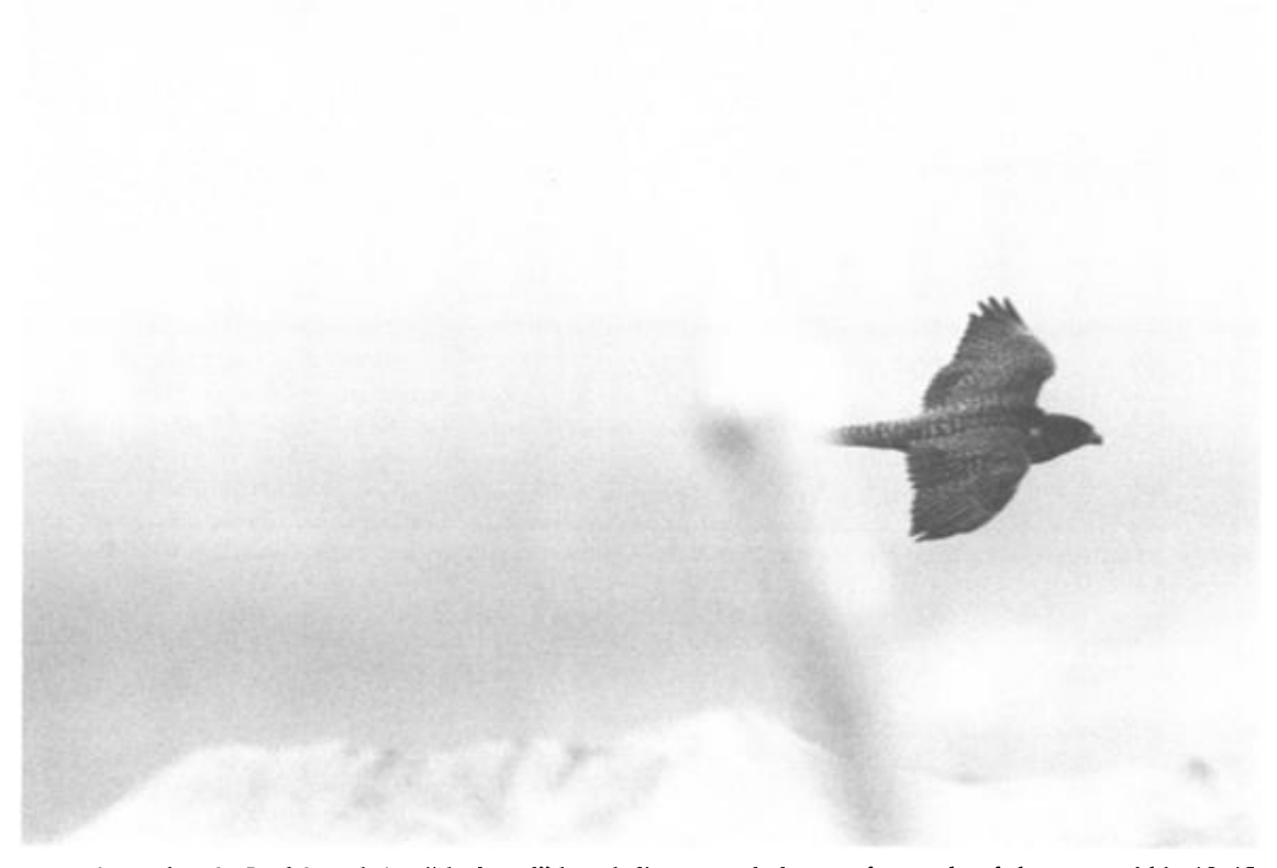
Figure 3. A female Gyrfalcon, being "shadowed" by a helicopter, calmly soared toward and then past within 12–15 m in front of the helicopter. The 2 m antenna on the helicopter's nose shows because the helicopter's slow forward motion was being stopped.

On 11 July the helicopter hovered about 14 m away from the cliff while the female completed an entire sequence of feeding young and then settled to brood without showing apparent distress from the presence of the helicopter. (See White and Sherrod 1973, for a photo from this feeding sequence and further discussion.)