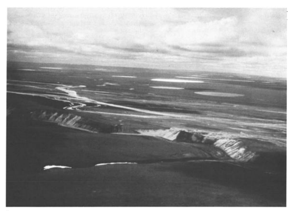
Figure 2. View from near eyrie 2 (see E2, Fig. 1) on 12 June showing the river valley in the midground and wet tussock-heath tundra with numerous lakes in the background.

greatest use (Fig. 2). Fifty-one percent (counting those where we started to follow him but then subsequently lost him) of the hunting forays occurred over this area. Likewise, the greatest amount of time was spent by the male in that area and he went farthest from the eyrie in that direction. West across the river an area of similar habitat but much drier and better drained received the next greatest use. About 36% of the hunting sorties occurred there.