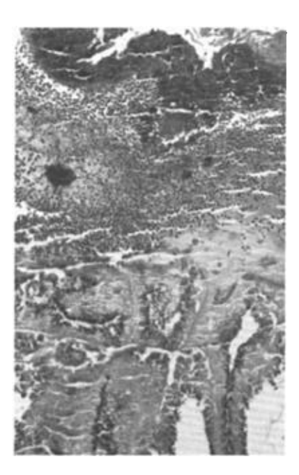
Figure 1. Low power photomicrograph of gastric mucosa covered by a fibrinopurulent pseudomembrane containing swarms of bacteria but with only superficial erosion of the glands.

after absorption has frequently lethal action (George et al. 1978). Most human cases are seen in patients on antibiotics, after serious surgical procedures, in newborn infants, and in patients in whom, for many different reasons, immunosuppression exists. Essentially identical pseudomembranous enterocolitis can be produced experimentally in rabbits (Kata et al. 1978) and hamsters (Rifkin et al. 1978). This falcon developed acute pseudomembranous gastritis histopathologically identical to human cases. That the bird died of resulting clostridial toxemia is suggested although not confirmed by culturing the suspected etiologic agent. It is possible the falcon ingested food with large numbers of clostridial organisms, a bacterium known to multiply with great rapidity under proper circumstances and that the stress of moving led to the rapid growth of those organisms in the gastrointestinal tract resulting in pseudomembranous gastritis. It is of interest that some birds and mammals are known to carry C. difficile in the intestinal track (McBee 1960).