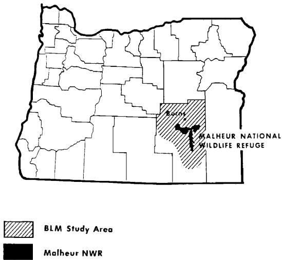
Figure 1. Location of Bureau of Land Management's nesting raptor inventory study area, in respect to Malheur National Wildlife, Oregon.