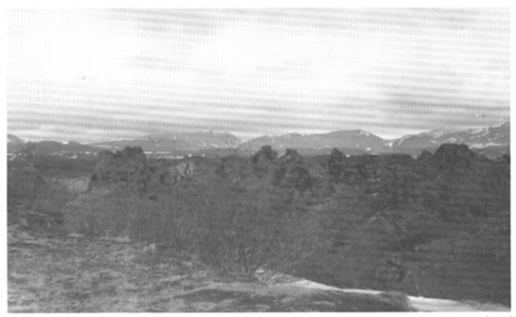
Figure 3. View from the lip of Dimmuborgir into the depression. The photo does not give an adequate idea of the depth or the extensiveness of Dimmuborgir. In the distance some of the hills that form the eastern boundary of the Myvatn basin. In the foreground low bushes of birch ( Betula pubescens ). May 1967.