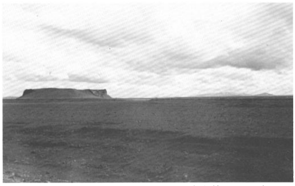
Figure 4. View of Hrossaborg from the road across the Burfellshraun. The Gyrfalcon eyrie is on the opposite side. Note the sparsely vegetated "sandy waste." In the distance are the mountains of the Central Highlands of Iceland. June 1967.